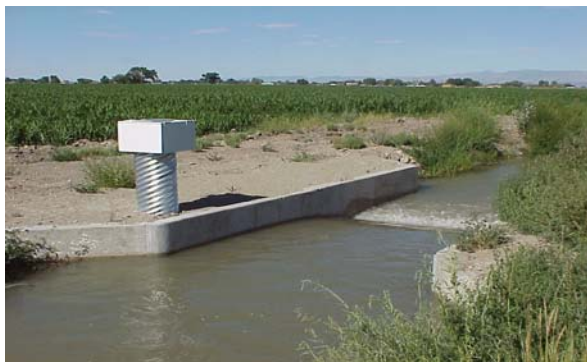
Figure 3. Rectangular Repleg flume with tapered entrance and smooth rounded edges (Truckee-Carson Irrigation District)

Another option is to provide additional side contraction by having vertical walls through the section as shown in Figure 3 (rectangular cross-section).