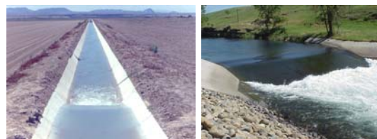
Figure 1. Replogle flumes in irrigation canals

Examples of Replogle flumes are shown in Figure 1 .