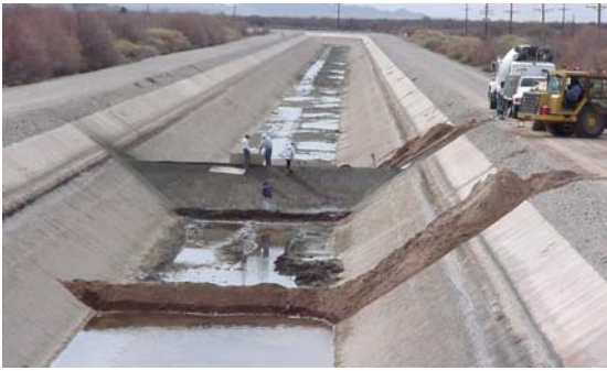
Figure 2. Trapezoidal Repleg flume in existing concrete lined canal

Another option is to provide additional side contraction by having vertical walls through the section as shown in Figure 3 (rectangular cross-section).