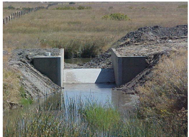
Figure 5. Constructed rectangular Replogle flume

The constructed flume is shown in Figure 5 .