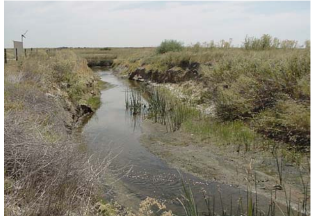
Figure 4. Location for new Replogle flume in an earthen lateral

To illustrate the proper design techniques summarized in this paper, the design for a Replogle flume in a medium-sized, earthen lateral ( Figure 4 ) is described. The minimum and maximum flow rates at this location are 5 and 90 cubic feet per second, respectively.