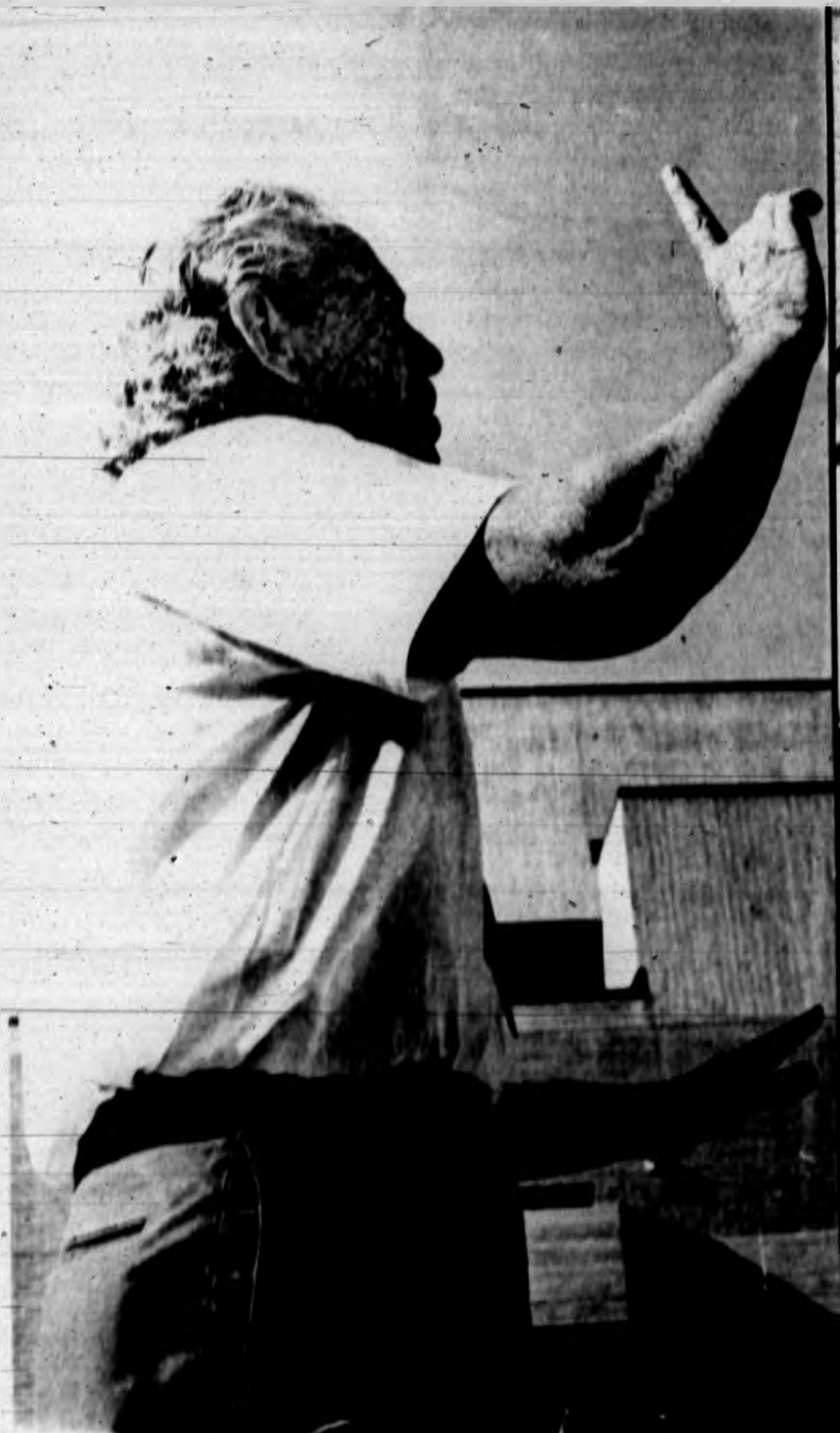
'I'll tell you what sin is!'