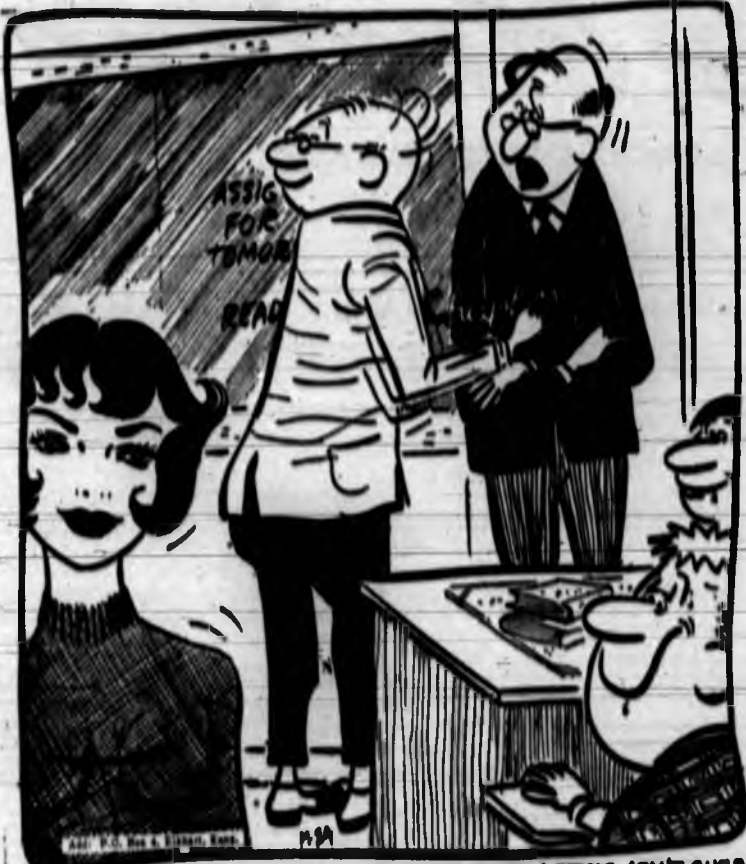
"SHE'S IN ONE OF MY CLASSES—RATHER DISTRACTING ISN'T SHE?"