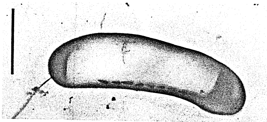
Figure 3. Electron micrograph of a magnetotactic bacterium, showing the chain of magnetosomes, and the flagellum at the left-hand side. The bar is 1 \mu\text{m} .

The magnetosomes of most of the magnetotactic bacteria that have been studied to date contain particles of magnetite, \text{Fe}_3\text{O}_4 , in the 40 to 100 nm size range. Recently, magnetotactic bacteria from high sulphide marine habitats have been found to contain ferrimagnetic greigite, \text{Fe}_3\text{S}_4 , which is isostructural with magnetite [25-28]. An example of a chain of magnetosomes within a bacterial cell is shown in Figure 3.