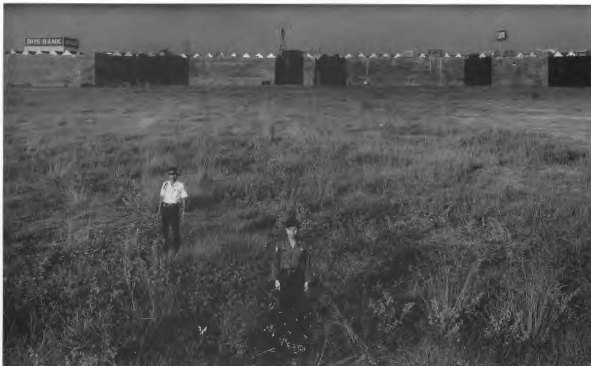
Figure 4 Security guard of Kelapa Gading “real estate” housing

Source: Hervé Dangla, Belantara Jakarta , Jakarta: Centre Culturel Francais, 1996.