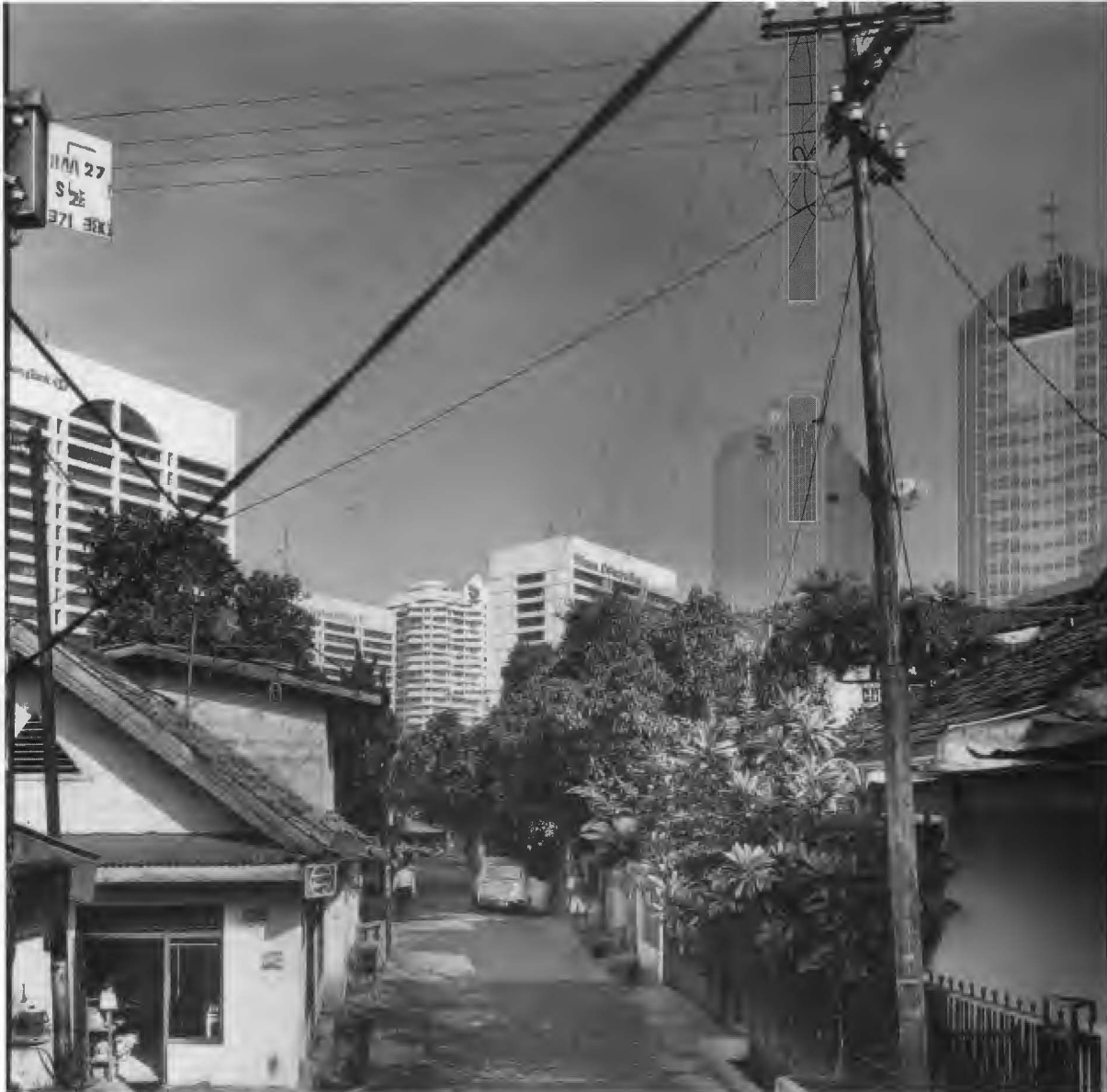
Figure 1 “Kampung” with skyscrapers at the background.

Source: Hervé Dangla, Belantara Jakarta , Jakarta: Centre Culturel Français, 1996.