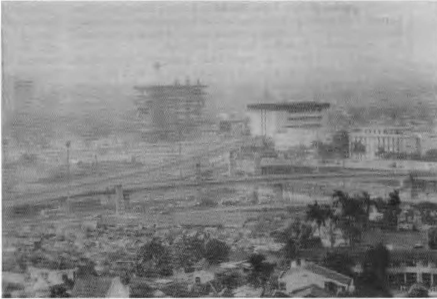
Figure 2 Elevated highways at Tomang, Jakarta

appropriating the excess of the nearby “ kampung ” youngsters who, in turn, gain extra income as passengers. In this way the urban excess is constituted both by the “ kampung ” youngsters as well as the riders in private cars who would perhaps have taken public transportation if not for its inefficiency. 9 Excess, hence, is the contradiction of development that produces “inappropriate” activities according to the standard of a “modern” capital city. 10 This surplus of population in the form of street urchins that “appear from nowhere” seems to be outside the spatial order of the city. It contributes to the predicament of Jakarta as a city saturated with “traffic jams” and “chaos.”