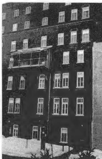
Fig. 4: Street view of Rental Units, Grandir en Ville, Quebec City.

create permanent housing for women only. There are 30 units and a six-bedroom transitional housing unit for women who have been in shelters. Women were involved in the design process, working with architect Joan Simon to develop housing that would respond to a range of needs. There are seven different unit designs. There is a shared courtyard and the co-op is part of a larger neighborhood of other non-profit, cooperative housing projects. The housing co-op is managed by the residents who have established committees for social activities, maintenance and policy (Figures 5 and 6).