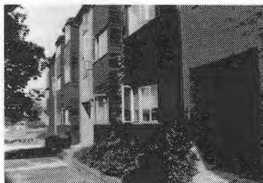
Fig. 6: Constance Hamilton Co-op. Toronto (1982). Entry Detail.