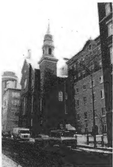
Fig. 3: View of converted chapel, Grandir en Ville, Quebec City.