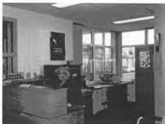
Fig. 2: Office on ground floor overlooks entrance. YMCA housing Toronto.

Among traditional women's organizations, the Young Women's Christian Association (YWCA) has been involved in housing Canadian women for the past century. Initially the YWCA's provided housing for single working women moving to cities. Then, the local YWCA organizations in cities began providing emergency shelters to women. The next phase was to develop permanent housing for women and children. In the province of Ontario, permanent housing has been developed by the YWCA in Toronto, Oshawa, Peterborough, and other cities. Typically, the local YWCA chapter has established a housing committee composed of staff of the YWCA, community representatives, and potential residents of the housing. They contracted with a resource group, a non-profit consulting group, to help them obtain public funding from the state housing sector, assist in negotiating the approval process, identify potential sites, help find an architect, and generally teach them the various stages involved in developing a successful housing project. Funds for non-profit housing are strictly limited in relation to the costs