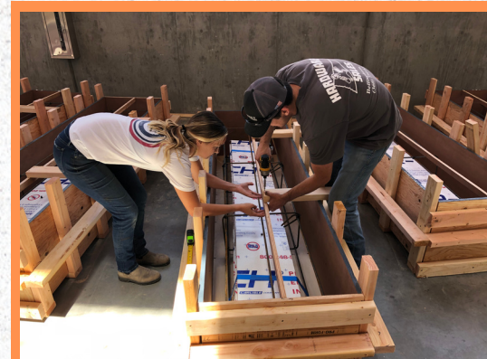
INSTALLING FORMWORK FOR DEPRESSED EDGE

Contact: kcruz4477@gmail.com (360) 594-1345