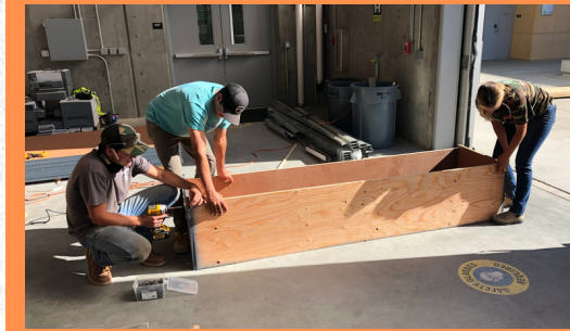
CONSTRUCTING PRO-FORM BOX