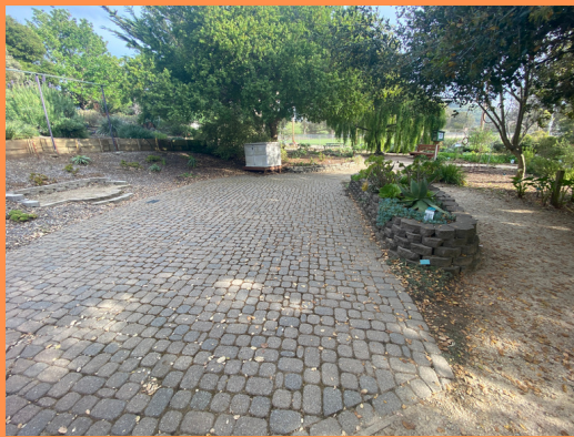
AMPHITHEATER SEATING LOCATION