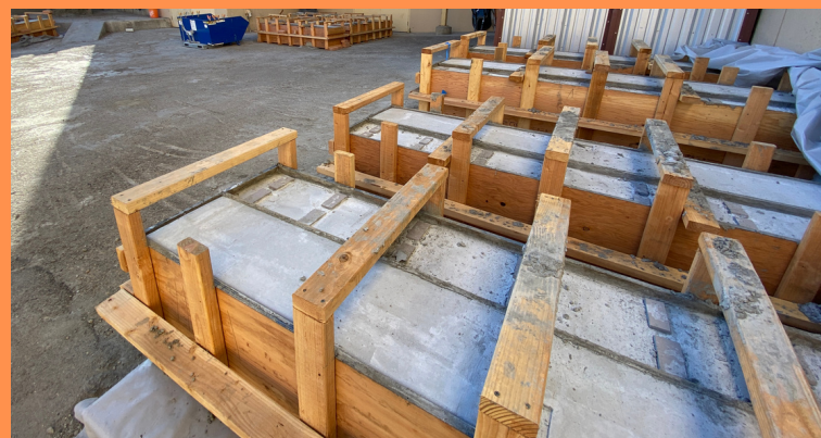
FORMWORK AFTER CONCRETE POUR