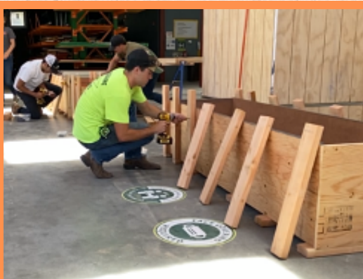
CONSTRUCTING FORMWORK BRACING