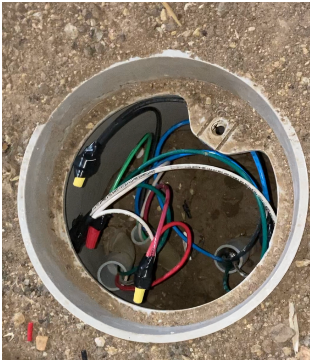
Pull Box With Splices