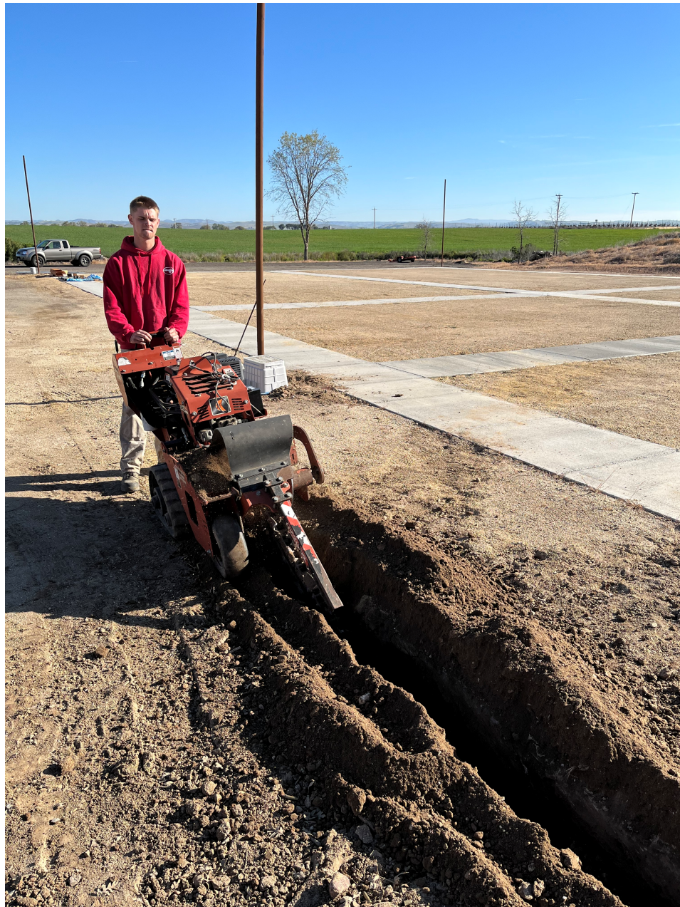
Trenching For Conduit