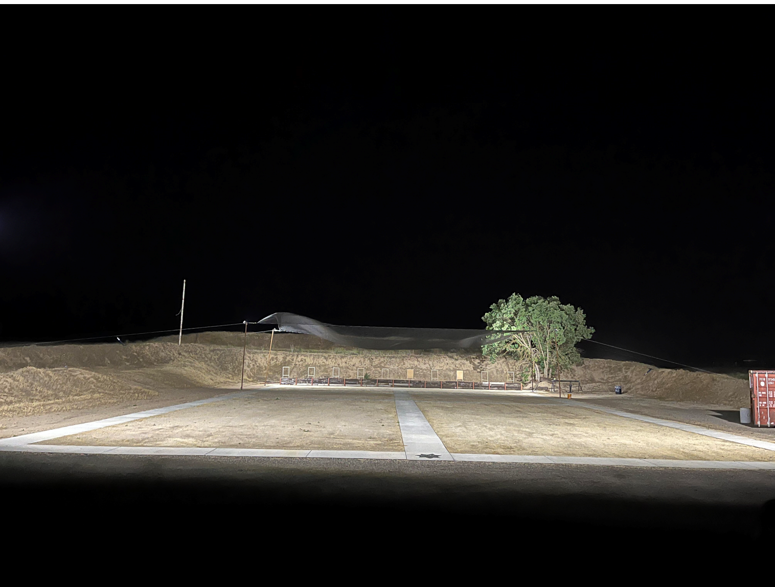
The Gun Range Lit Up at Night (Facing Targets)