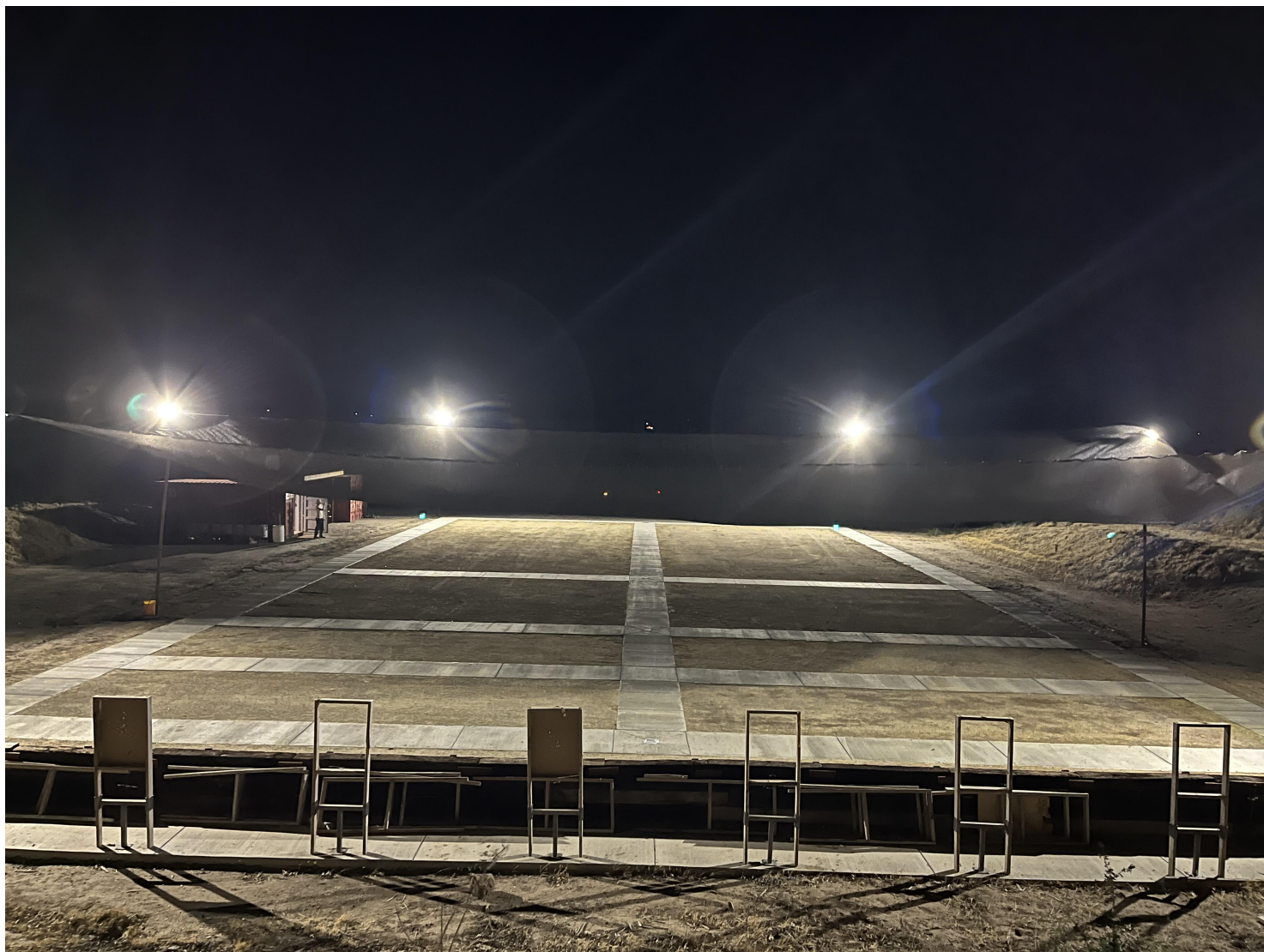
The Gun Range Lit Up at Night (Behind Targets)