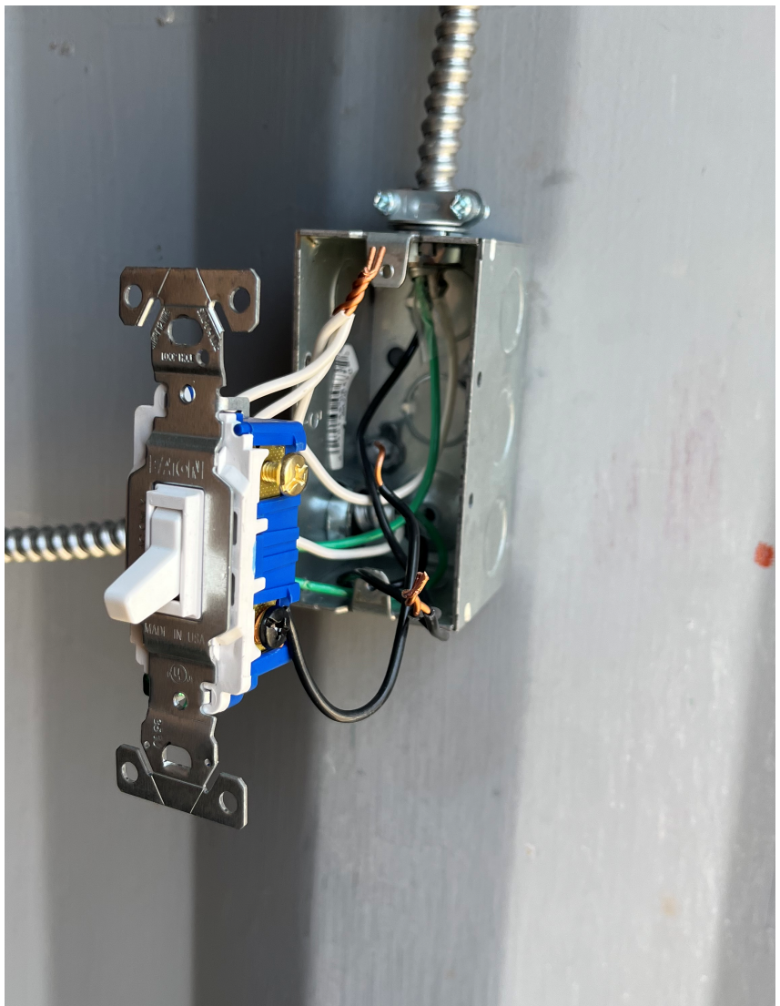
Light Switch Wiring