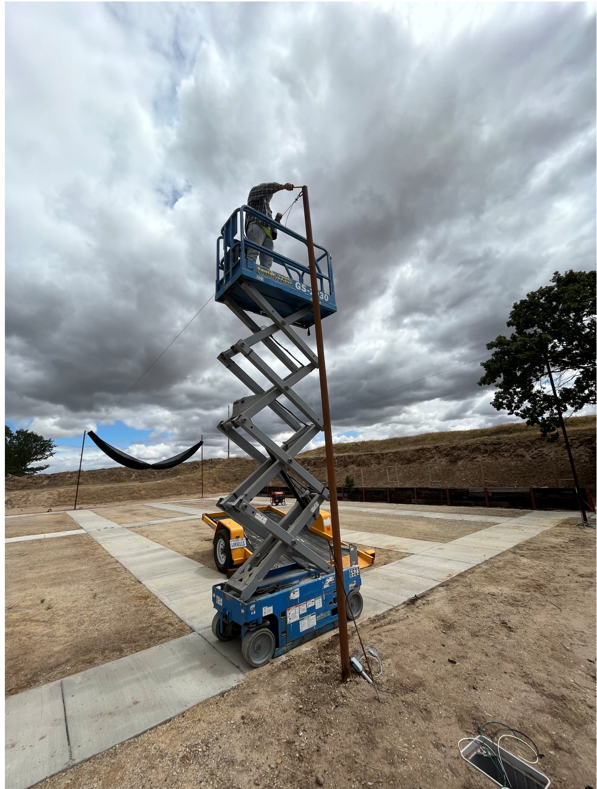
Scissor Lift Action Shot