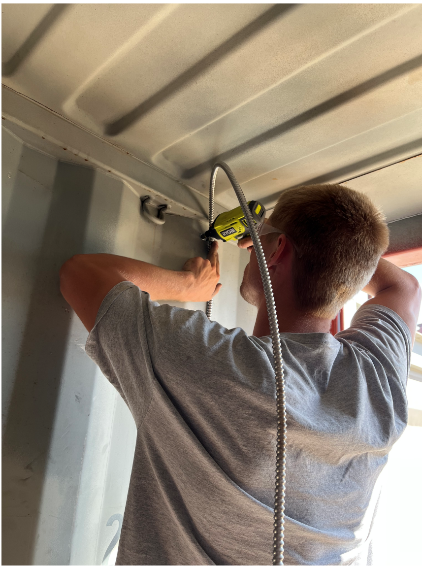
Armored Cable Install