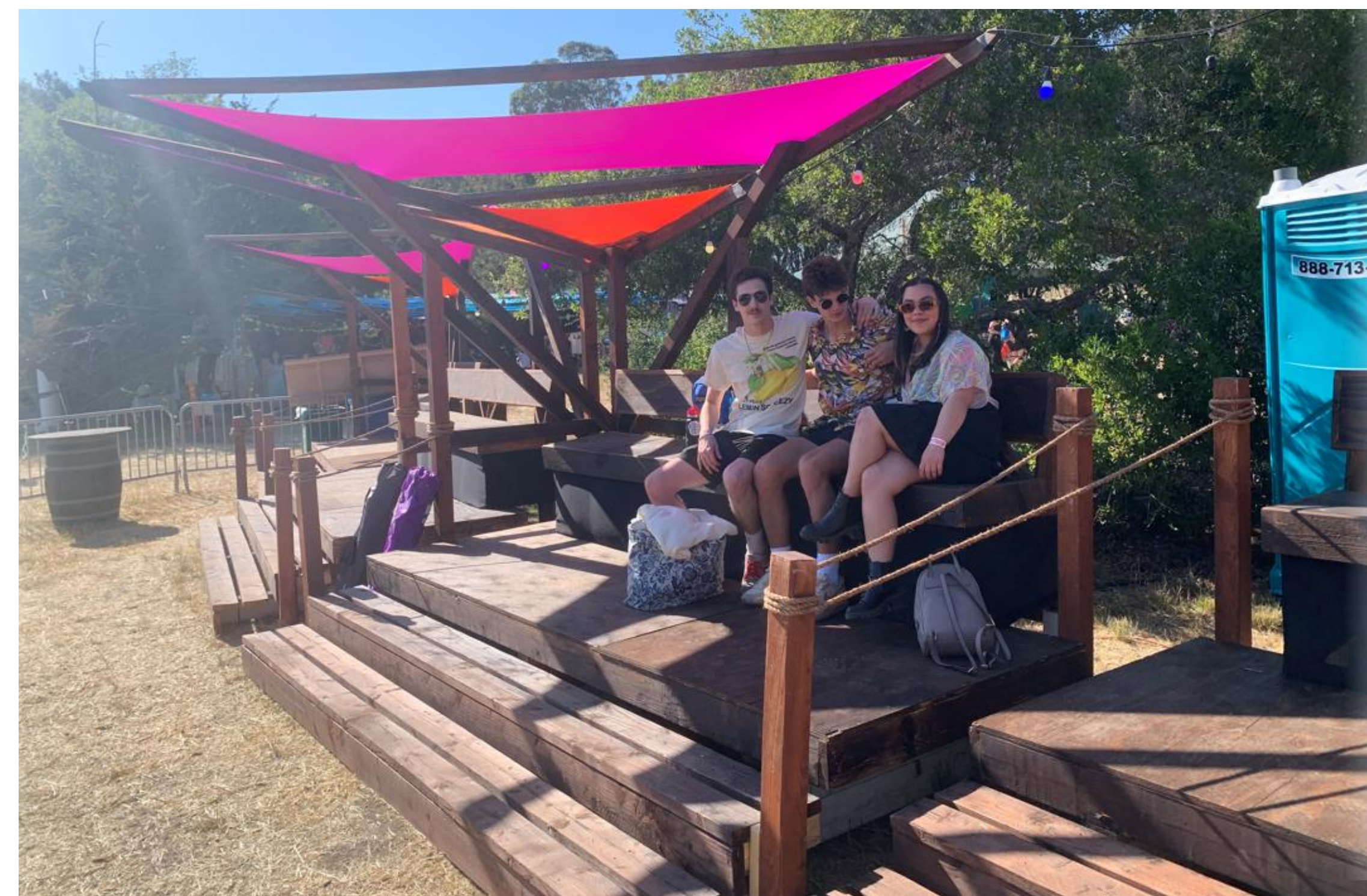
Finished Booths at Festival