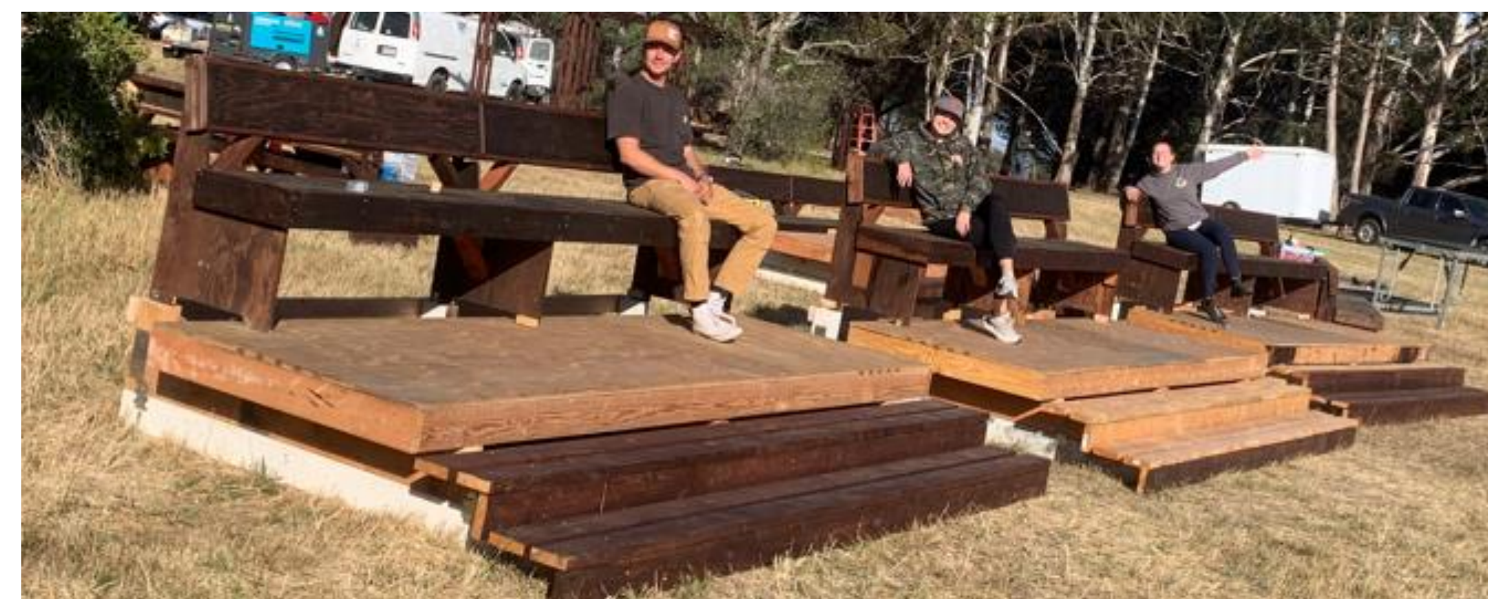
Laguna Lake Set up