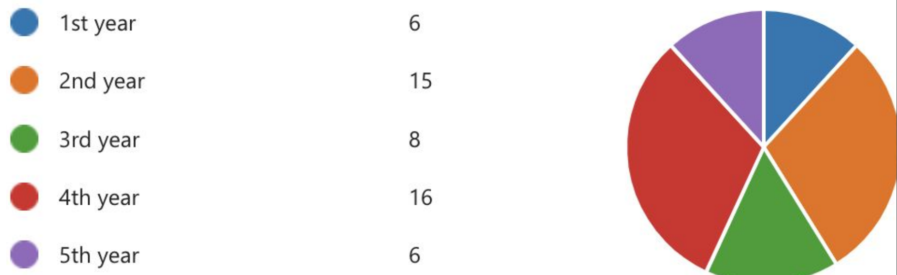
What year are you?

International travel is extremely beneficial to those working in the construction industry as they can study foreign business practices, architectural styles, and intercultural communication. While Cal Poly has had a successful summer study abroad program in the past, the faculty leaders are looking for student feedback to help better structure the program. This project is designed to gauge interest from the CM student body of a summer program in Prague. Students were sent a survey that asked them to answer 6 questions regarding the future program.