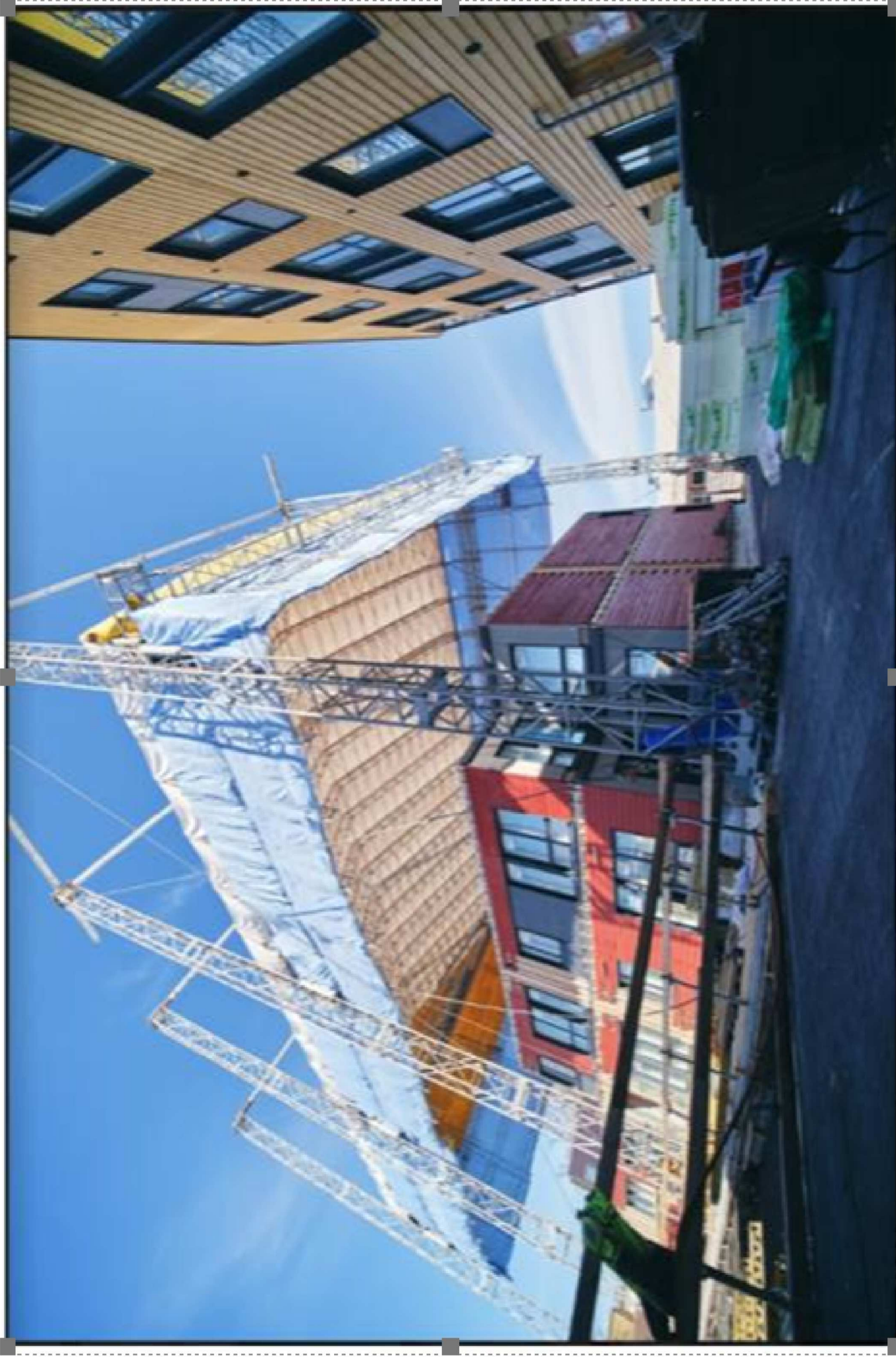
Weather Cover with an integrated crane

Key Words: Modularization, Panelization, Timber, Case Study, Efficiency