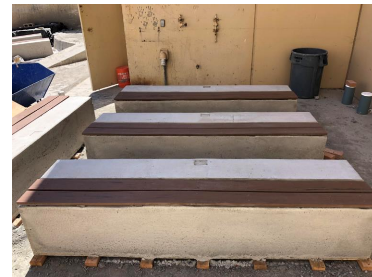
The finished product after our concrete pour and attaching the Trex decking to the concrete.