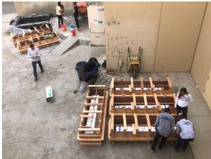
Getting the formwork laid out properly the morning of our pour day before the concrete truck showed up.

Key Words: Benches, Wood, Concrete, Formwork, Rebar