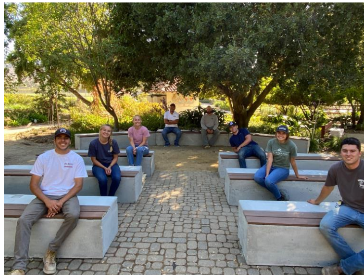
Our team enjoying the comfortable seating of the benches after a long day of transportation and install.