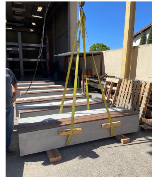
Getting hoist set for the first bench to deliver

Key Words: Benches, Wood, Concrete, Formwork, Rebar