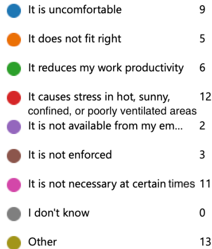
What are some reasons for not wearing your PPE? (Select all that apply)