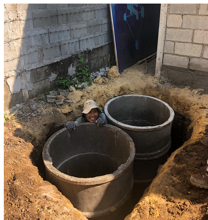
6 foot septic tank holes we dug.