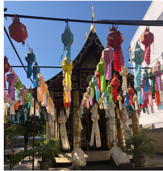
Small neighborhood temple near the job.