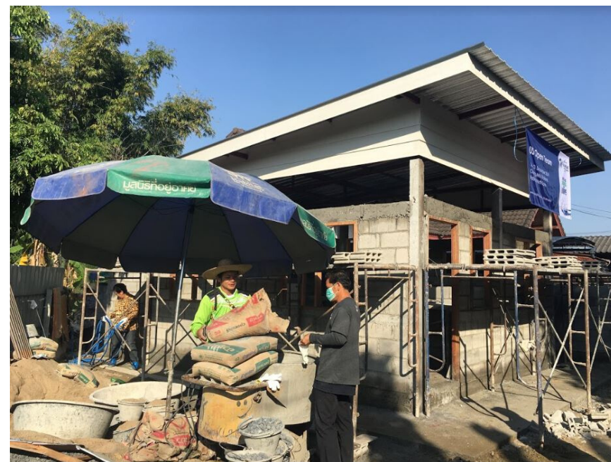
Local labor bringing in more bags of cement.