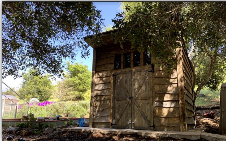
Completed Storage Shed Project