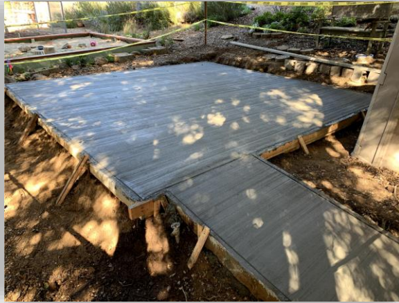
6" Thick Concrete Foundation

Key Words: Shed, Coordination, Design, Carpentry, Construction