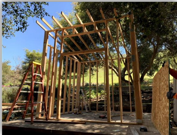
Completed Shed Wood Framing