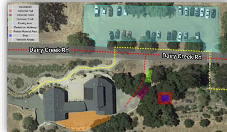
Project Site Logistics Plan