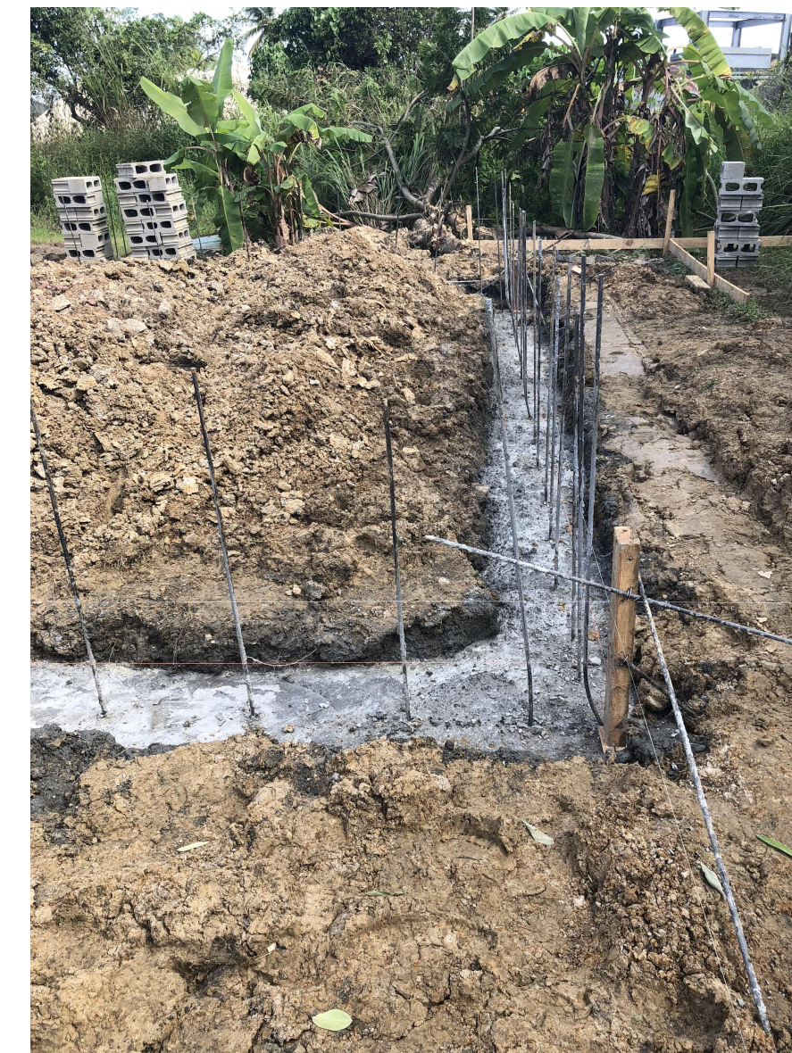
Day 4 - Lay CMU blocks