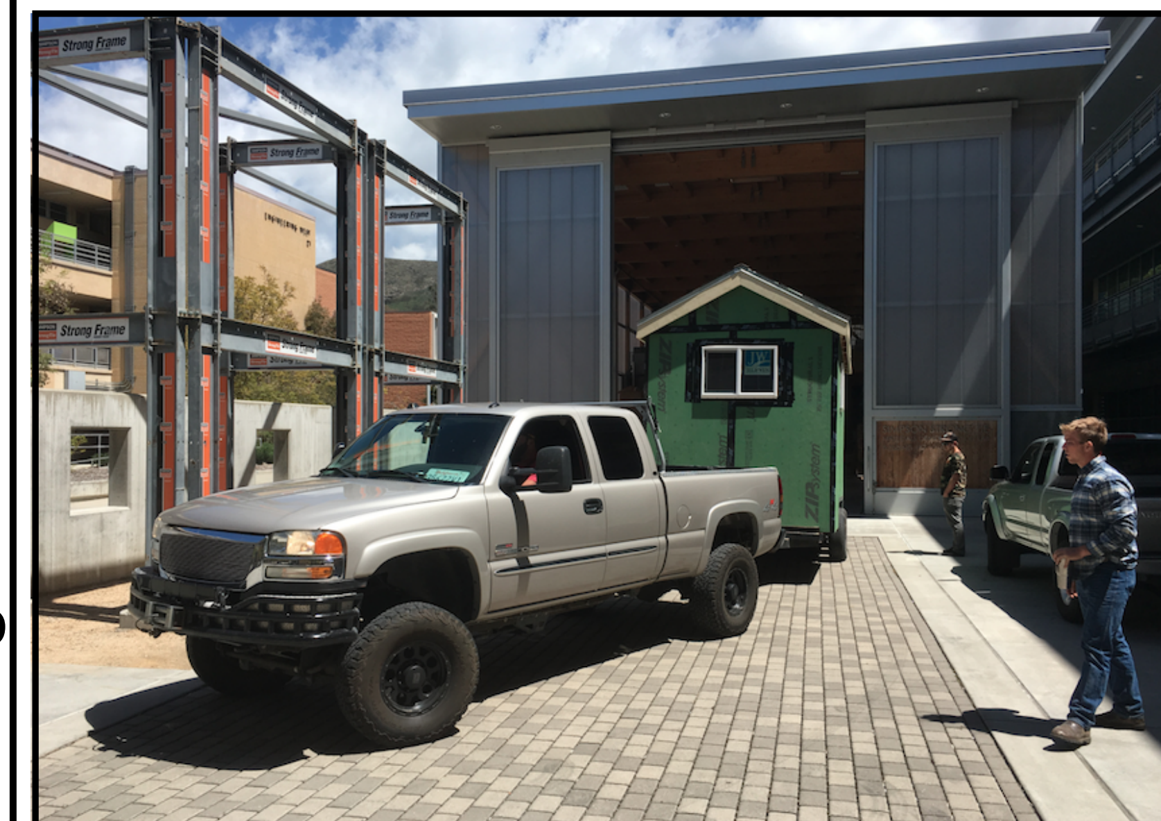
Moving Day for the trailers

According to a census done in 2017, there are approximately 1,125 homeless people living in San Luis Obispo. €This fall the Cal Poly Construction Management Department decided to do something to try and help these individuals €The Residential Construction Class teamed up with the nonprofit, Hope's Village, to build two tiny homes that will one day be used for homeless to live in. I was part of this process as I am a technical assistant in the Simpson Strong-Tie building where construction management students do their building. This project required much more planning than the normal 6' by 8' sheds that are built three times a quarter. These two tiny homes were twice the size and because of these obstacles, the Cal Poly department was only able to build the structures, but not finish the exterior siding. As the two tiny home structures and roofs were completed, they soon needed to be moved out into the weather with little protection from the elements. I was unsure of how long they would be sitting for, and did not want all the hard work and materials to be wasted, so I quickly volunteered to complete the siding for both tiny homes and ensure they were water tight.