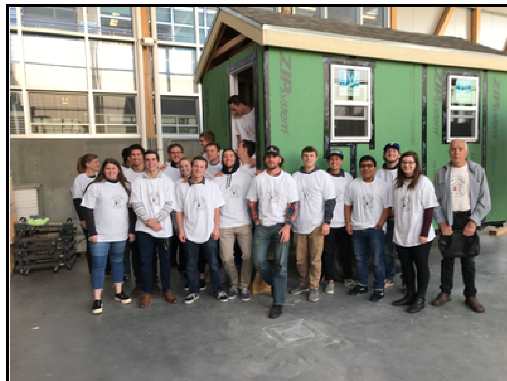
Cal Poly Winter Residential Class with Hope's Village Employees upon Completion of structure

According to a census done in 2017, there are approximately 1,125 homeless people living in San Luis Obispo. €This fall the Cal Poly Construction Management Department decided to do something to try and help these individuals €The Residential Construction Class teamed up with the nonprofit, Hope's Village, to build two tiny homes that will one day be used for homeless to live in. I was part of this process as I am a technical assistant in the Simpson Strong-Tie building where construction management students do their building. This project required much more planning than the normal 6' by 8' sheds that are built three times a quarter. These two tiny homes were twice the size and because of these obstacles, the Cal Poly department was only able to build the structures, but not finish the exterior siding. As the two tiny home structures and roofs were completed, they soon needed to be moved out into the weather with little protection from the elements. I was unsure of how long they would be sitting for, and did not want all the hard work and materials to be wasted, so I quickly volunteered to complete the siding for both tiny homes and ensure they were water tight.