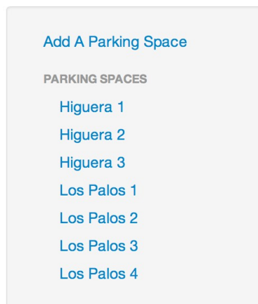
Sample list of parking spaces

On the left side of the screen, you are shown a list of parking spaces that you currently manage.