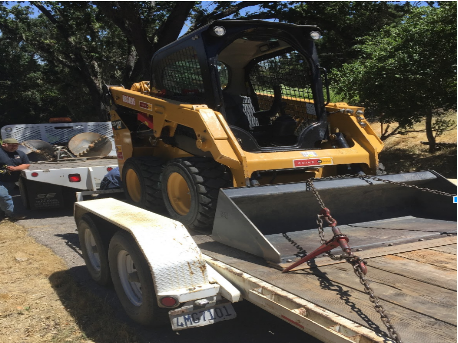
Cat Skid-Steer used on a asphalt replace project in Templeton, CA. The project was planned and executed by 4, Cal Poly Construction management students.