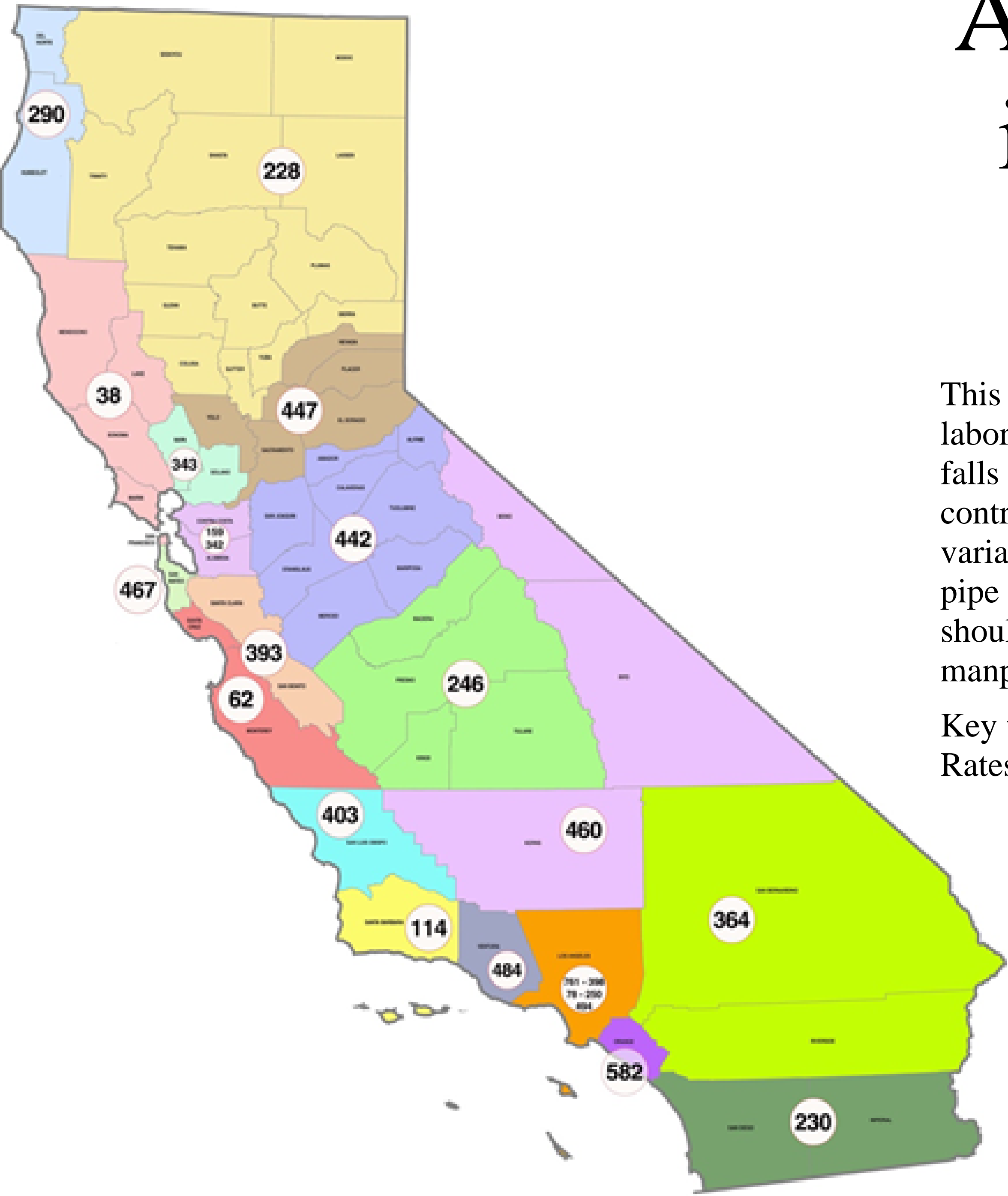
California UA Jurisdictional Map

Delta Between Original Estimate and Adjusted Estimate: ~ 5%