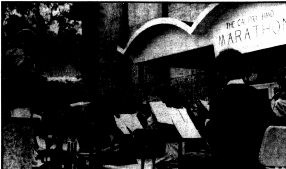
The Cal Poly Band enters the final stretch of its 24-hour marathon Friday morning. The fundraiser was held to help pay for a summer trip to Europe.