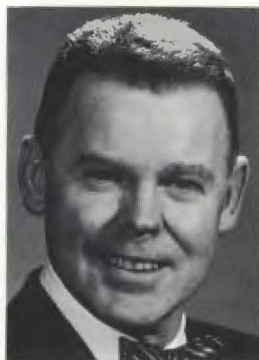
President John M. Pfau

The California State College at San Bernardino is located five miles north of the City of San Bernardino on 430 acres at the foot of the San Bernardino National Forest. A special arrangement of existing and future buildings with extensive tree plantings and landscaping around small courts, plazas and well-protected exterior spaces will make the campus an oasis of shade in the summertime and a compact academic complex designed for "the walking student" when wintertime caps the surrounding mountains with snow. The campus mall begins at the terminus of State College Parkway which connects it to Highway 395, the Barstow freeway.