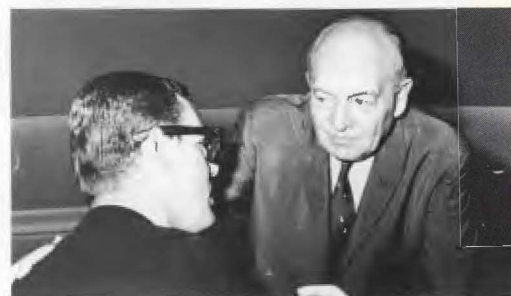
Institute speaker Harold E. Stassen listens to a student-posed question on space-age issues.

From the first presentation to the concluding remarks on Aug. 27, San Diego SC's educational radio station KEBS broadcast the proceedings live, rebroadcasting some morning sessions at night for the convenience of its listeners. Tape recordings of the Institute's meetings are now being distributed by KEBS to radio stations throughout the U. S.