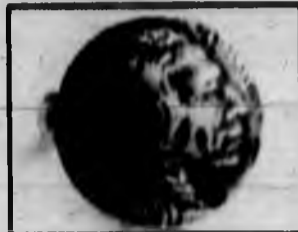
INDIAN HEAD NICKEL