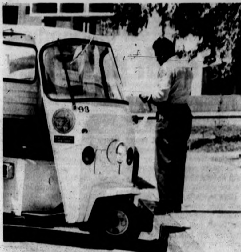
Campus security officer hops out of his Pushman scooter to bag another parking violator.