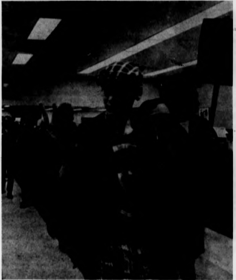
The protesters moved through the middle of the Bank of America twice.

The whole time the demonstrators were under heavy police surveillance. There were no arrests in the second demonstration.