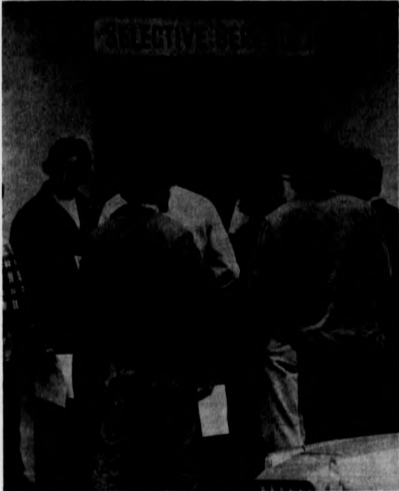
72 protesters gathered in front of the local Selective Service Board.