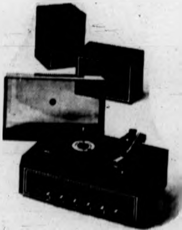
Largest selection of 4-8-cassette tapes.

Solid State Dual Channel Amplifier—20 Watt Output—Integrated AM-FM-FM STEREO Tuner—Two speaker system with one 6" oval speaker in each enclosure—Deluxe BSR fully cartridge—Diamond and Sapphire needles—Three piece system of Tuner-Amplifier-Record Changer, 2 speakers in walnut finish contemporary cabinetry plus tinted dust cover.