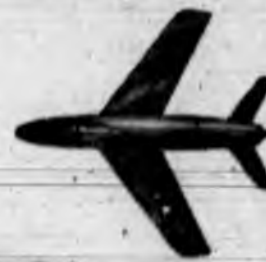
P-601 America's first all-weather, one-man interceptor