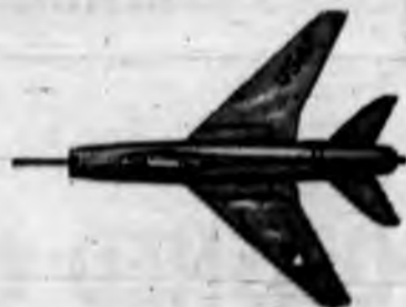
P-509 America's first operational supersonic fighter