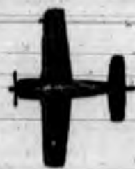
T-28 Worthy successor to the world famous AT-6

NORTH AMERICAN HAS BUILT MORE AIRPLANES THAN ANY OTHER COMPANY IN THE WORLD