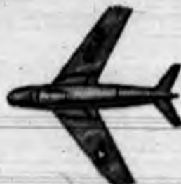
F-86 The Sabre Jet that turned the tide in the Korean War