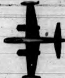
B-45 America's first four engine jet bomber