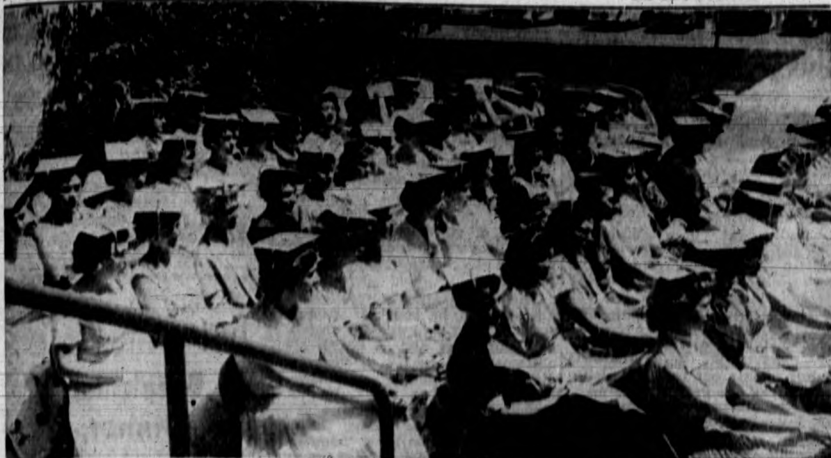
IT'S WORTH IT... For student wives sharing their part of the grind, here's a bit of inspiration—the Spring Quarter class of Ph.T.'s (Pushing Hubby Through). Ph.T.'s of past years, by the way, are thinking of forming an alumni auxiliary.