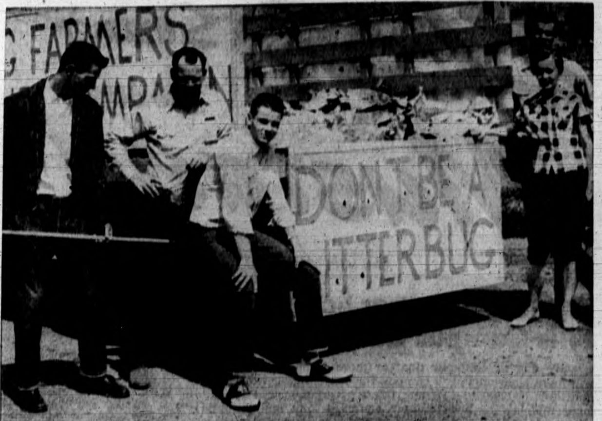
SIXTEEN HOURS PER DAY ... If each person on campus would save the custodial crew just one minute per day through glowing paper and other materials in the proper containers, almost seventeen hours would be salvaged. By Summer Quarter's end it would total more than 1,100 hours, Nuff said?

Hill climbs involve cars traveling a certain route up a hill. The best time in a class also wins.