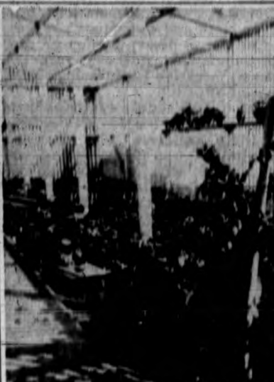
Been up the hill to see the OH Dept.? It's one of the finest set-ups of its kind on the coast.