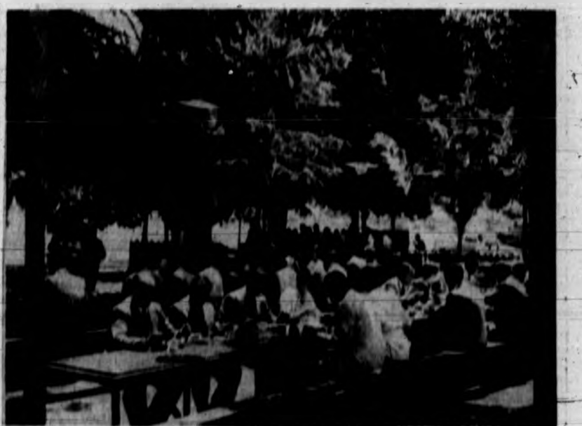
BARBECUE GROVE ... Just as the Association of Operative Millers featured their technical conference with one of Poly's famous barbecues at Poly Grove, so will the Education Dept. this coming week. Education majors, summering teachers, and friends are invited.

"The future leaders you teachers develop must preserve the patience and understanding of the people, for if that patience and understanding is ever lost, it could be disastrous to agriculture."