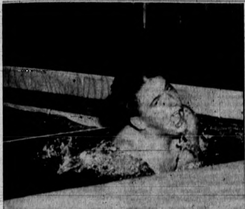
HAVE A GOOD TIME... But watch out for over-exertion warns the staff at the Health Center. Beaches, the pool, mountain hikes, tennis, etc., can be fun if undertaken wisely. Health Center's summer schedule is carried elsewhere in this issue.

The population of San Luis Obispo now exceeds 17,000.