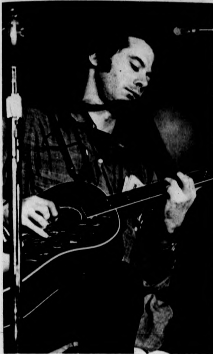
Guitarist John Fahey ran the guitar gamut with his performance before some 800 people Saturday night.