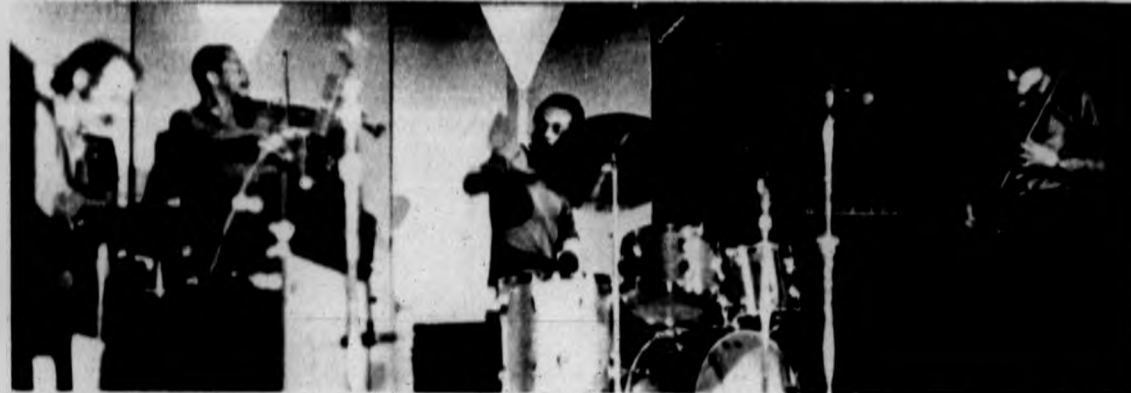
Progressive jazz ensemble, the Fourth Way, got into electrified jazz with an organ, violin, drums and guitar in their concert Saturday.