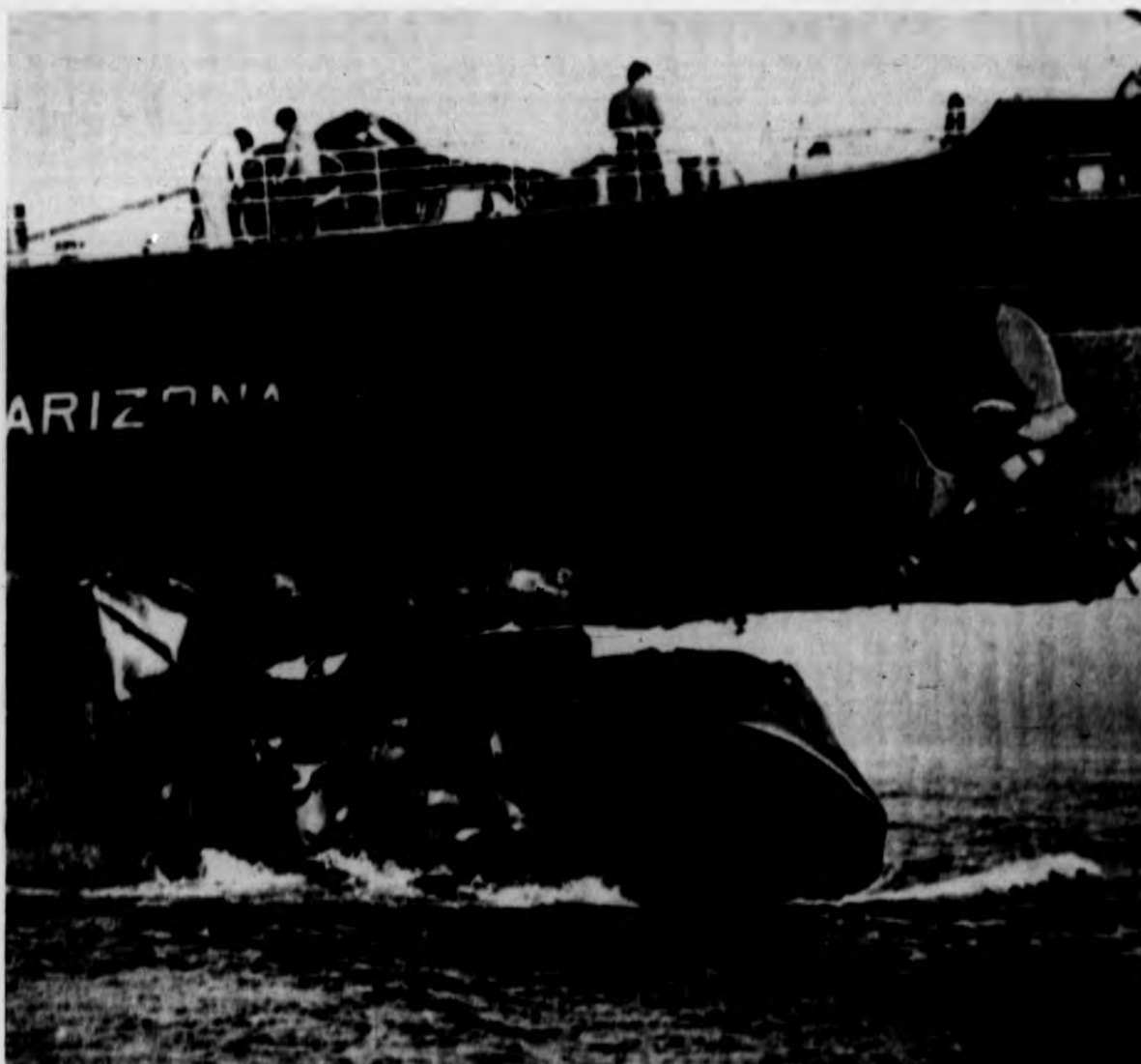
Yesterday two fully loaded tankers collided under the Golden Gate Bridge in a thick pre-dawn fog, spilling oil into San Francisco Bay. There were no injuries here, the tanker Arizona Standard, freed

The Coast Guard and oil company sped boats to the scene to drop floating containment booms and pump the fuel oil from the ruptured tanks into barges. No injuries were reported to the 35 man crew of either vessel.