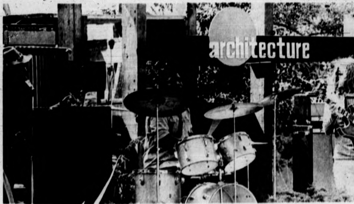
The architecture patio will be the scene for free concerts throughout the quarter. Yesterday's group was the 'Ark'.