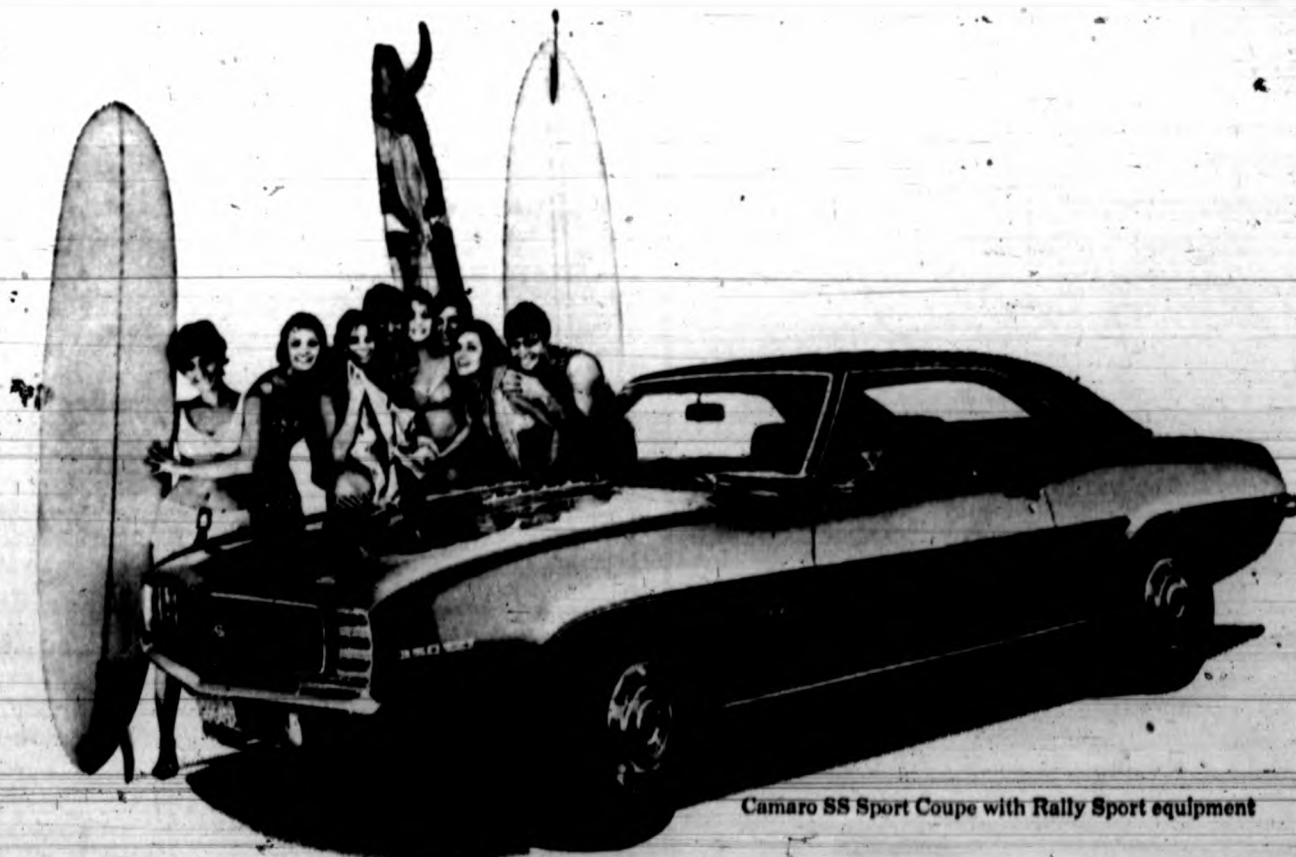
Camaro SS Sport Coupe with Rally Sport equipment