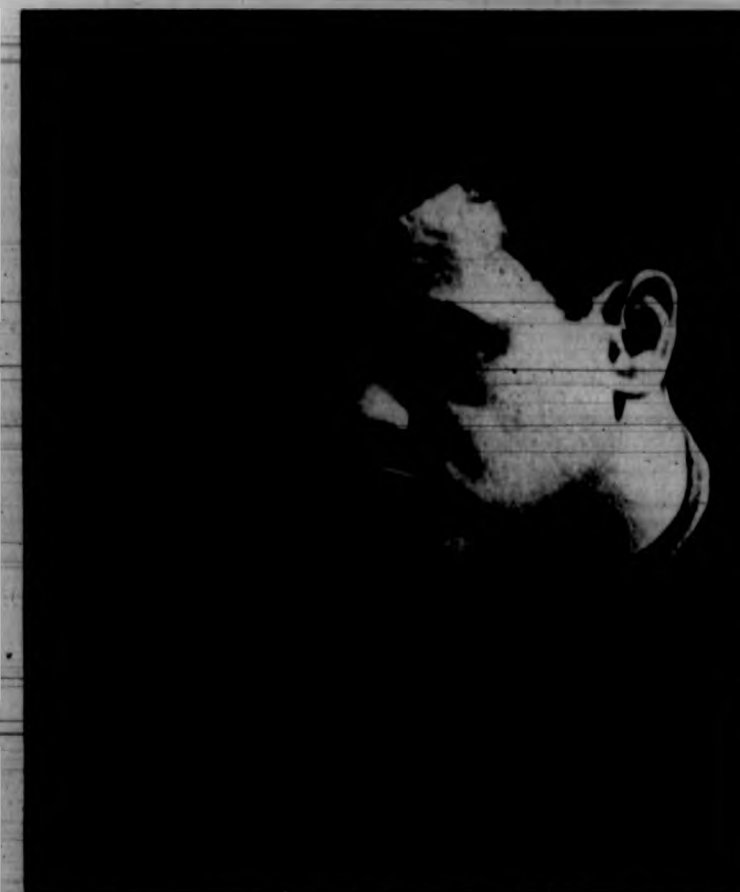
GEORGIA REPRESENTATIVE... Julian Bond, after a prodding fight to gain his seat in legislature, continues to fight against Vietnam involvement, the ABM system, trusting politicians and fighting for his people.

to do both. But I hope they choose the community for their radical movements." Since the death of Martin Luther King, many "indigenous" black groups have evolved. These groups, said Bond, are all working toward furthering black economic and social conditions. The one incongruity, he feels, is the lack of exchanges between black people. "There will never be another King," he stated matter-of-factly. "There will never be another black leader around whom all black people can unite. So these militant groups, these indigenous groups, must interact and communicate if they believe in common goals." Ralph Abernathy, King's successor, is "earthy and honest" in Bond's opinion, but is "certainly not King." Rural poor people are just as poor now as they were ten years ago. The poverty focus has switched to the urban poor and the ghetto, but Bond feels McGovern's Hunger Commission is changing that. "I'm deeply concerned about the rural poor in this country, and the public must be made aware of the hungry—so everyone will get enough sleep." (continued on page 8)