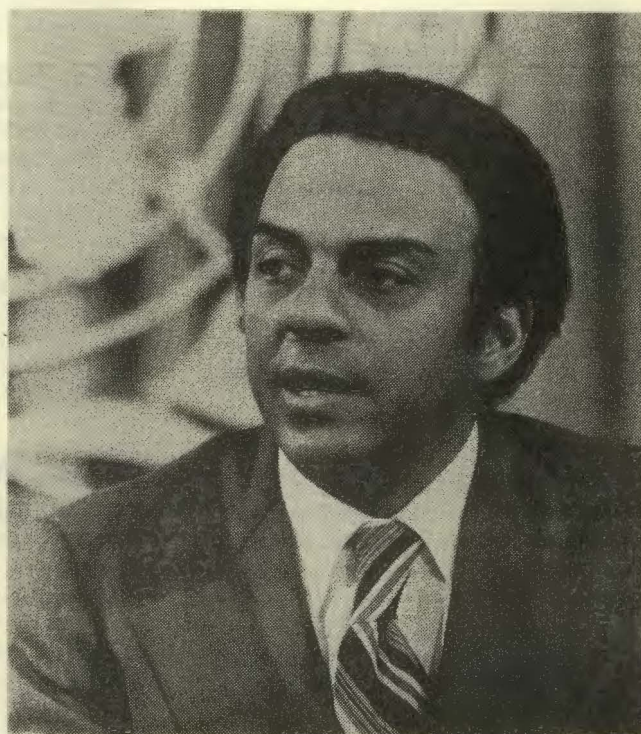
Andrew Young, civil rights leader, former Ambassador to the United Nations, and Mayor-elect of Atlanta, will speak on morality and politics in Chumash on Monday, Nov. 23, at 8 pm, in a lecture sponsored by Speakers Forum of the ASI.