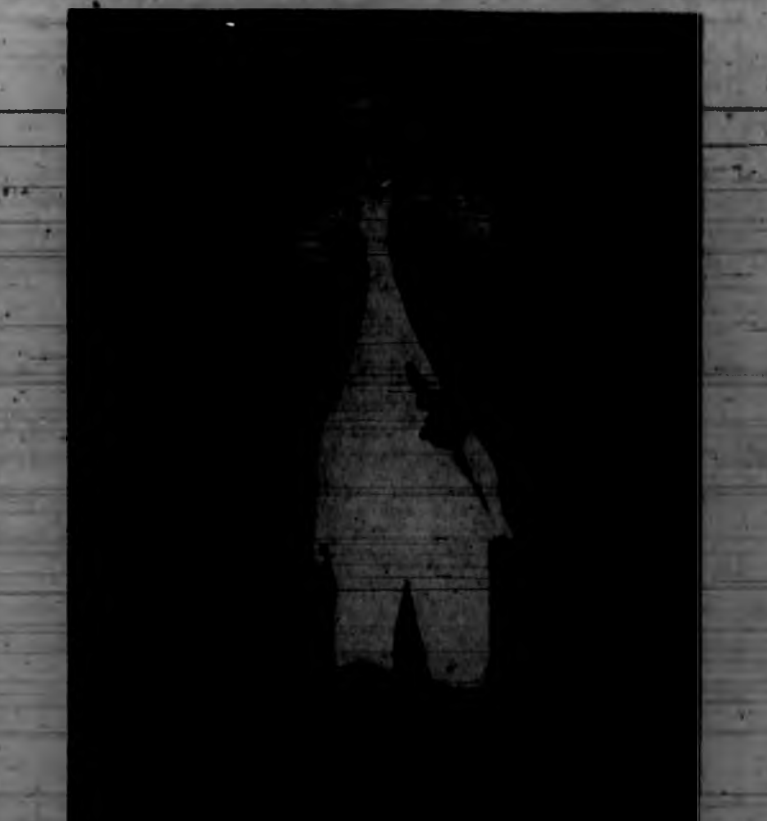
"THE DEVIL'S DISCIPLE... One of the actors in 'The Devil's Disciple' is shown during dress rehearsal earlier this week. The three act melodrama dealing with the Revolutionary War will be presented tonight and tomorrow night at 8:30 p.m. in the Little Theater.