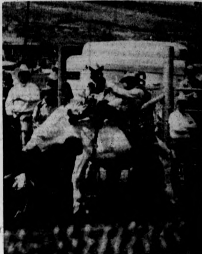
RODEO HIGHLIGHT... While extending its record for the year to 9-0 at the regional finals, the Cal Poly rodeo team now has an eye on dethroning three time champion Caspar (Wyo.) Junior College in the National Intercollegiate Rodeo Association's Championship finals.