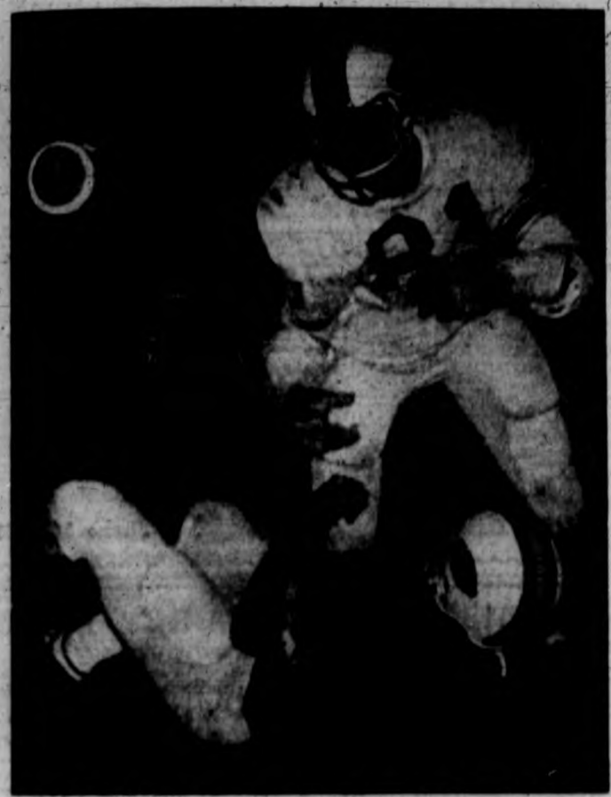
THE NEW SEASON... Green halfback Ken Dalton (42) has his back on the ground but still manages to keep White end Bill Schwerm (81) from catching the pass in this second-quarter action of the Poly spring football game.

boots - boots - boots - boots - boots - boots - boots - boots