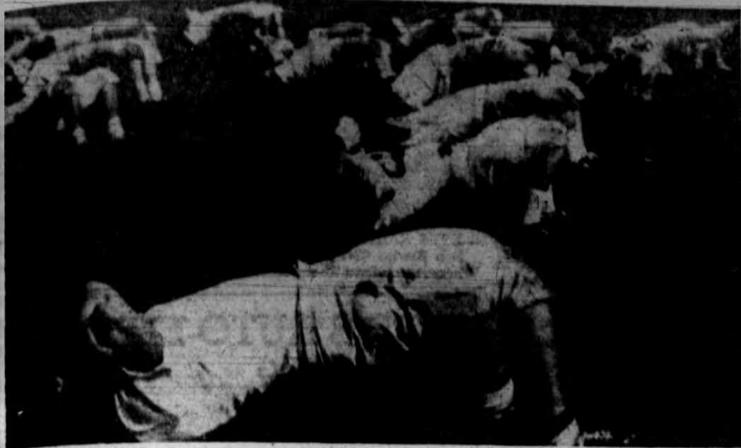
LET'S LIMBO . . . Grid aspirants are put through contortions as prelude to spring workouts. The name of the game is conditioning

and the spring practice sessions are no exception. Practice will last 20 days.