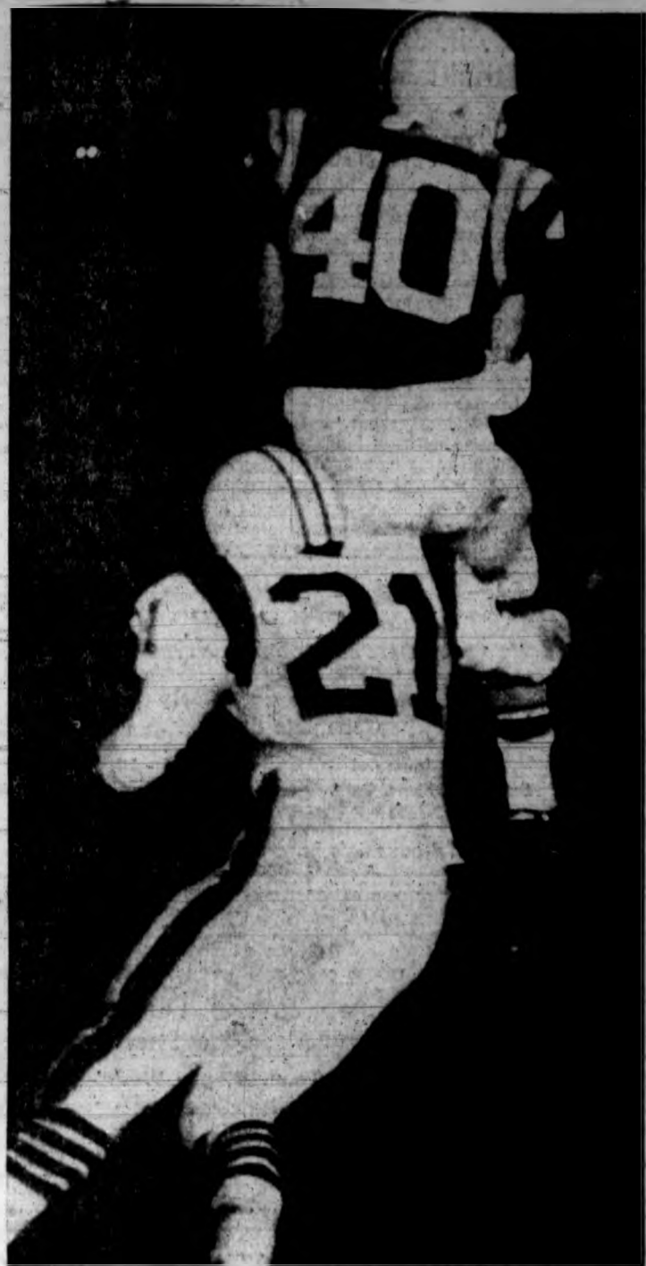
Ride High You Mustangs