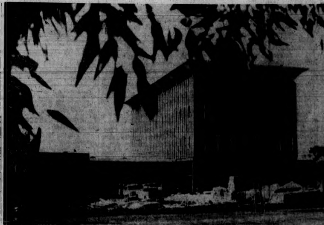
CAMPUS ADDITION . . . Completion date for the new Administration Building has been scheduled for mid-November. The $1.7 million building will hold the Business and Education Departments.