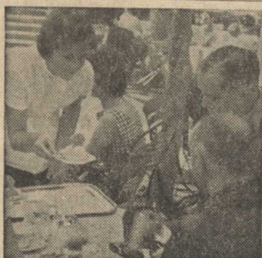
A U.S. co-ed serves ice cream in Europe

• 972 FOOTHILL BOULEVARD, SAN LUIS OBISPO