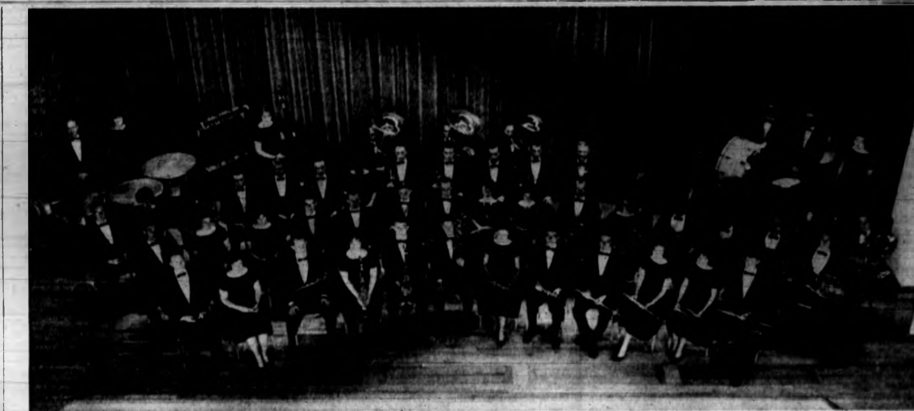
BAND TOUR PREVIEW . . . Boundless will be the scope of the program to be presented during College Hour.