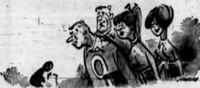
Wise but kindly—astute but compassionate

I leapt up from my typewriter and ran as fast as my little fat legs would carry me to the makers of Marlboro Cigarettes, and I tugged my forelock, and I said, "Sir, I am well aware that you have engaged me to write a humor column, but today, as I approach the final column of the season, I am far too misty to be funny, for the final column of the season is, after all, a leave-taking, and when I think of saying goodbye to my audience—the sweetest audience any columnist ever had—the college students of America—wonderful human beings, every man and