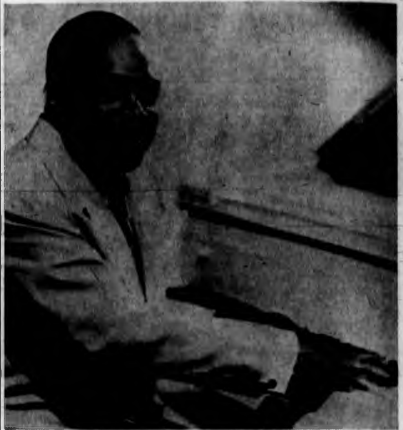
BABIE PLAYS . . . Count Basie and his world renowned 16-piece band will be on campus tomorrow evening for the Spring Prom, from 9 p.m. until 1 a.m. in the Men's Gym. Tickets can still be obtained at the ASB Office or at the door for $1 with ASB cards and $2 without.