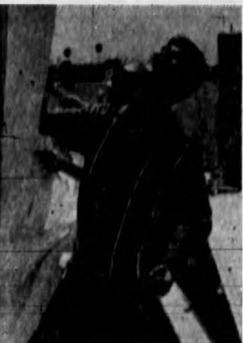
MALOLO PICCADILLY LANE feathered stripe, lorry lined jacket with lorry trim on front. Topped with standard Hawaiian cotton trunks. Both of 100% cotton. In color combinations of olive, olive and blue ground. Jacket $8.95. Trunks $5.95.