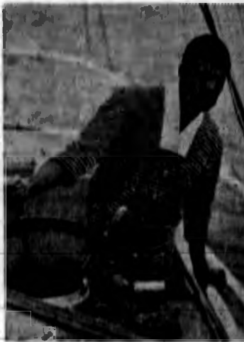
JACK TAR British knit cardigan with 1/2 length sleeves and stand-up collar. Knit of 100% fine cotton. Square rig fitted trunks of cotton and rubber. Combinations of gold, olive and navy with white. Cardigan $5.95. Trunks $5.95.

COLLEGE SQUARE SHOPPING CENTER 884 FOOTHILL BLVD.