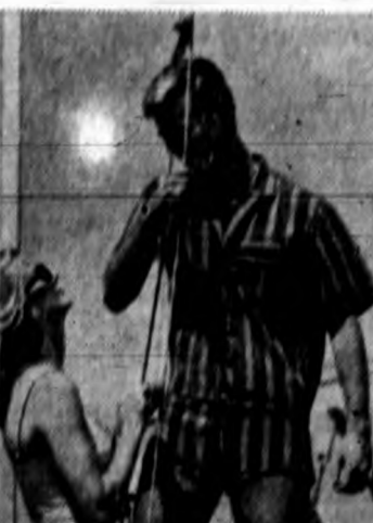
MALOLO LIGHT BRIGADE regimental stripe jacket with British accented collar and over-size pocket. Shell head buttons. Shown with tailored front zip trunks. Of 100% woven cotton in color combinations of gold/red or grey/green. Jacket $8.95. Trunks $6.95.