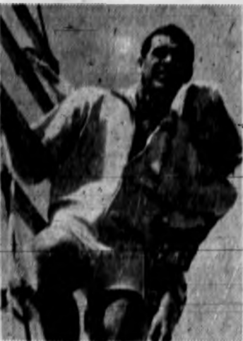
MALOLO ADMIRALTY wind-warrior 100% cotton gabardine jacket with bow's neck and British collar. Matching tailored Hawaiian trunks. In white, gold, natural, olive and blue with contrast braid striping. Jacket $7.95. Trunks $5.95.