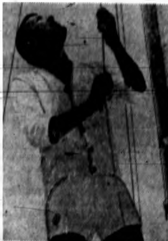
STORM WARNING 100% cotton knit. Cardigan with 1/2 length sleeves. Contrast tone trim on jacket and matching front zip Hawaiian trunks. "Storm Guard" embroidered on jacket pockets and trunks. Colors in white, gold or olive. Cardigan $9.95. Trunks $7.95.

California with the British style influence to brighten your seaworthy command.