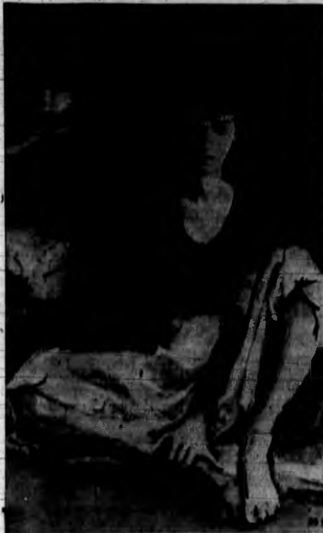
Dancers at Rest striking study in chertreuse, green and brown Sale Price $1.00

Giant Color Prints — Reproductions of famous masterpieces Singles - Portfolios - 75 to choose