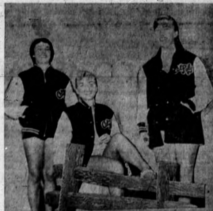
Three pretty Poly coeds model the different style Cal Poly jackets including the $19.95 wool quilted lined waist jacket and the two $21.50 (note difference in collars) ¾ all wool jackets. All three have the exclusive Beno horse leather patented cuff.