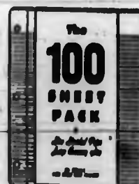
Binder Paper Ruled and Plain 100 sheet economy pack 45¢