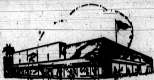
Riley's—Chorro at Marsh