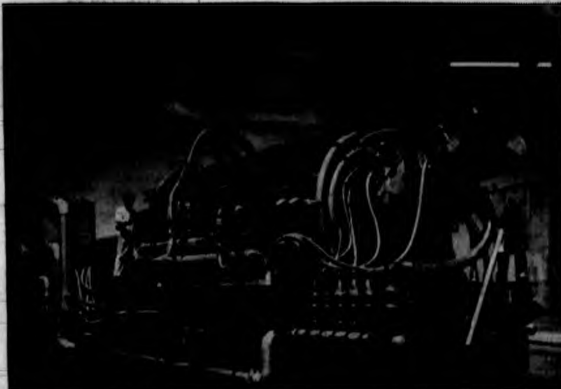
Tory IIA is the first of a series of test reactors being developed under the Lawrence Radiation Laboratory's nuclear ramjet program.

A reactor for ramjet propulsion must operate at high power levels yet be of minimum size and mass. Its design must consider the very high pressure drop across its length, the stress loads due to flight maneuvering, and the extremely