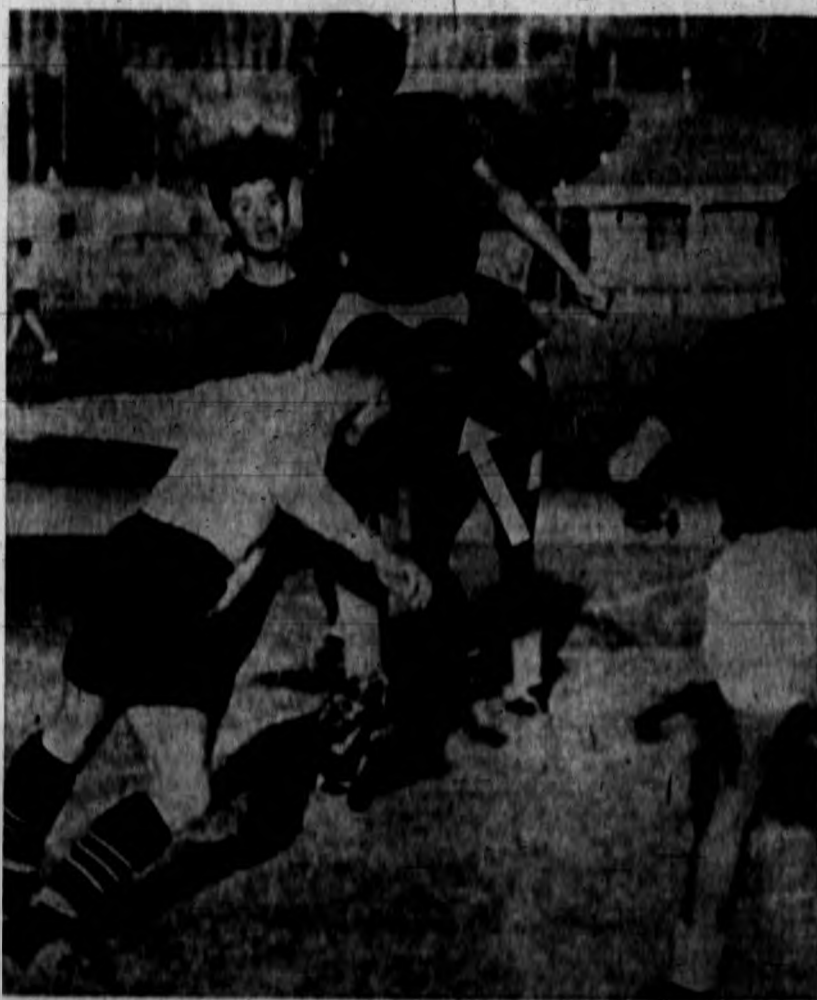
USING HIS HEAD . . . An unidentified San Jose State soccer player uses his head in passing the ball—note arrow—during a bit of action against Mustang kickers last week. The Spartans won 3 to 0.