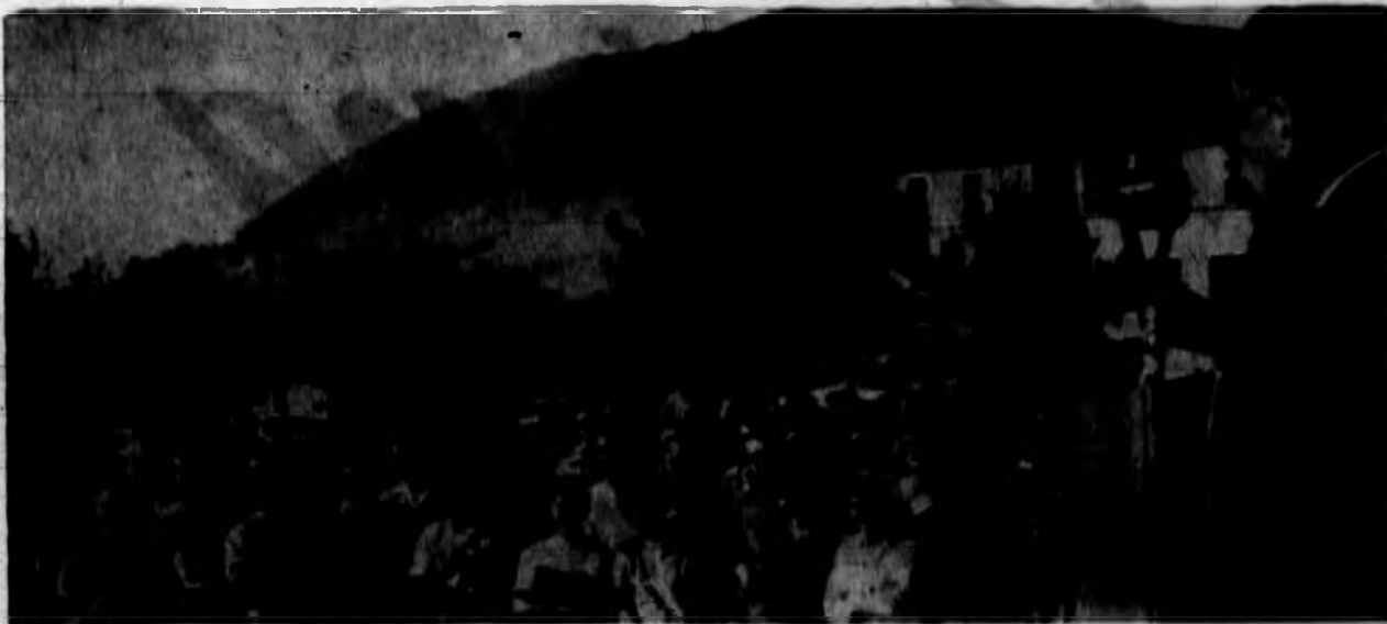
GOVERNOR BROWN . . . Gov. Edmund Brown speaks at a Young Democratic rally Friday after attending an early breakfast meeting at Morro Bay. Appearing on behalf of the Kennedy-Johnson ticket, the governor also asked support for Democratic candidates in state and national races.