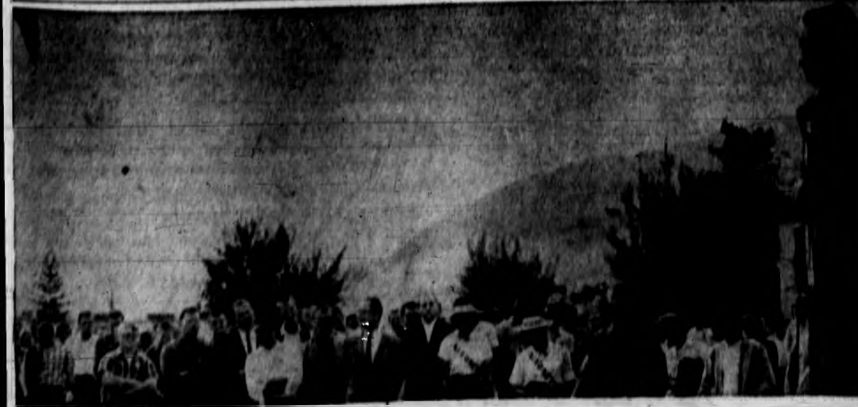
HAWAII SENATOR . . . First U.S. senator from Hawaii, Kiram Fong arrived here Thursday morning for a rally and tour at Cal Poly. Fong was sponsored by the Young Republican Club.

Due to last minute mechanical difficulties today's El Mustang has been limited to two pages.