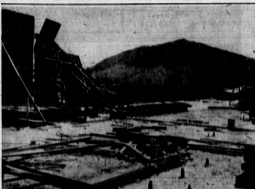
AND THE WALLS CAME TUMBLING DOWN—As in Jericho, some of the walls of Cal Poly came down last weekend. High winds are blamed for loosening the siding forms on the new "cafeteria-to-be," causing the one section of the structure to topple.