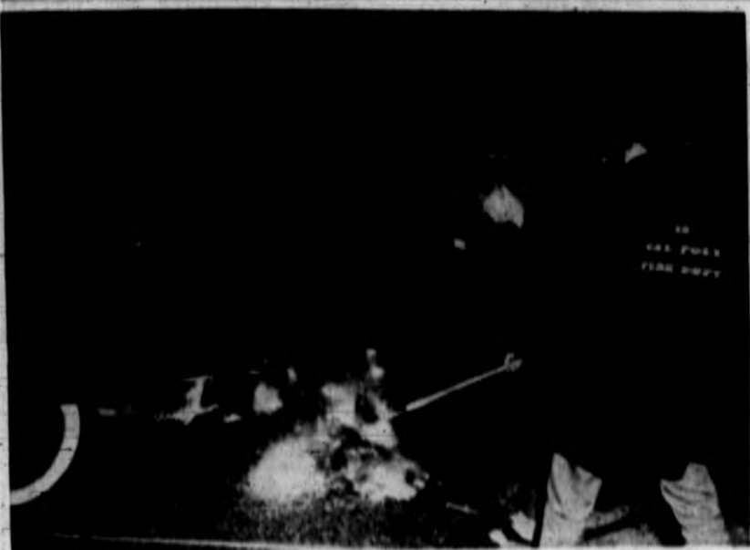
NOT ONE—Fire completely destroyed a 1952 Oldsmobile convertible belonging to Hank Wendell, Electronics major from Ingwood, early Sunday morning. The car was parked near Poly Grove. According to Security, the Cal Poly Fire Department was summoned at 1:45 A.M. and by 2:35 A.M. the blaze was extinguished. The fire is of undetermined origin and is under investigation.

The next person to need blood at Cal Poly may be you, and the life you save may be your own!