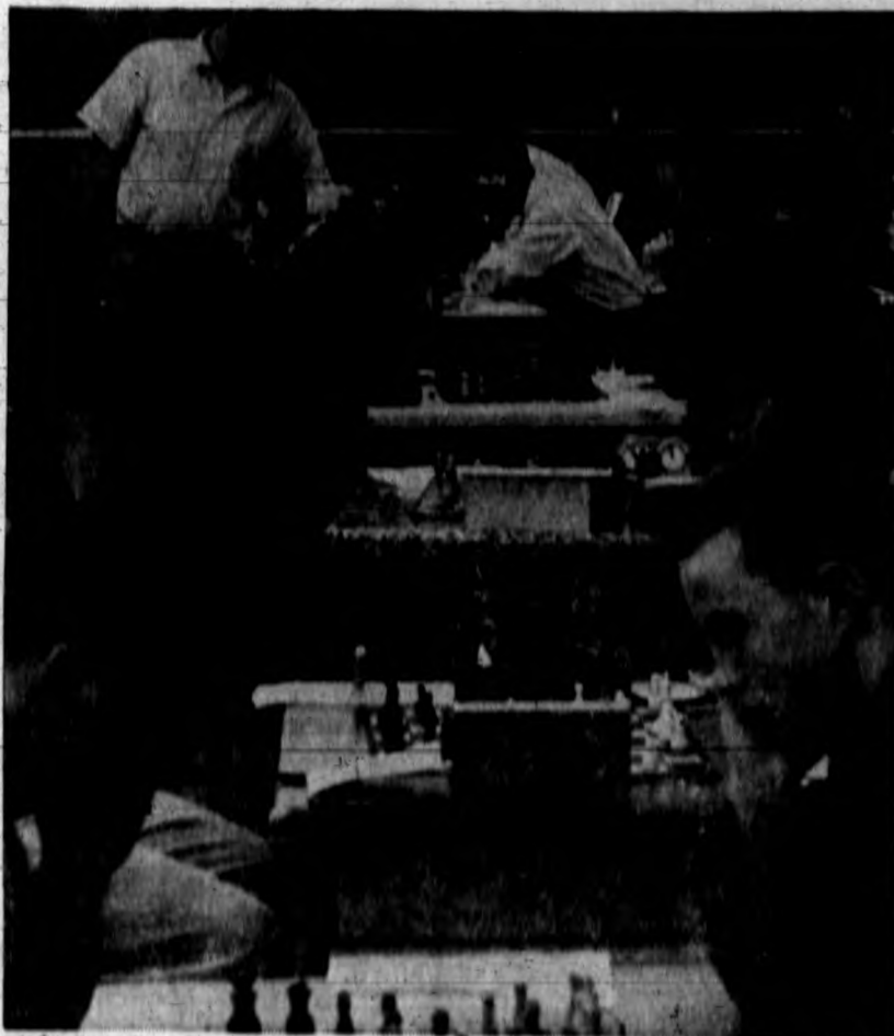
CONCENTRATION ... This was the prevalent theme last weekend in Cal Poly's second annual intercollegiate Chess Tournament. The above picture shows a small portion of the "scheming" contestants that competed for honors.