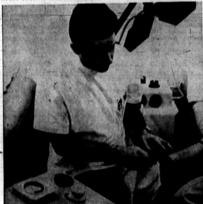
ULTRA-SONIC . . . Here heat is applied to smaller areas by ultra-sonic stimulating equipment which is especially good for back pains.