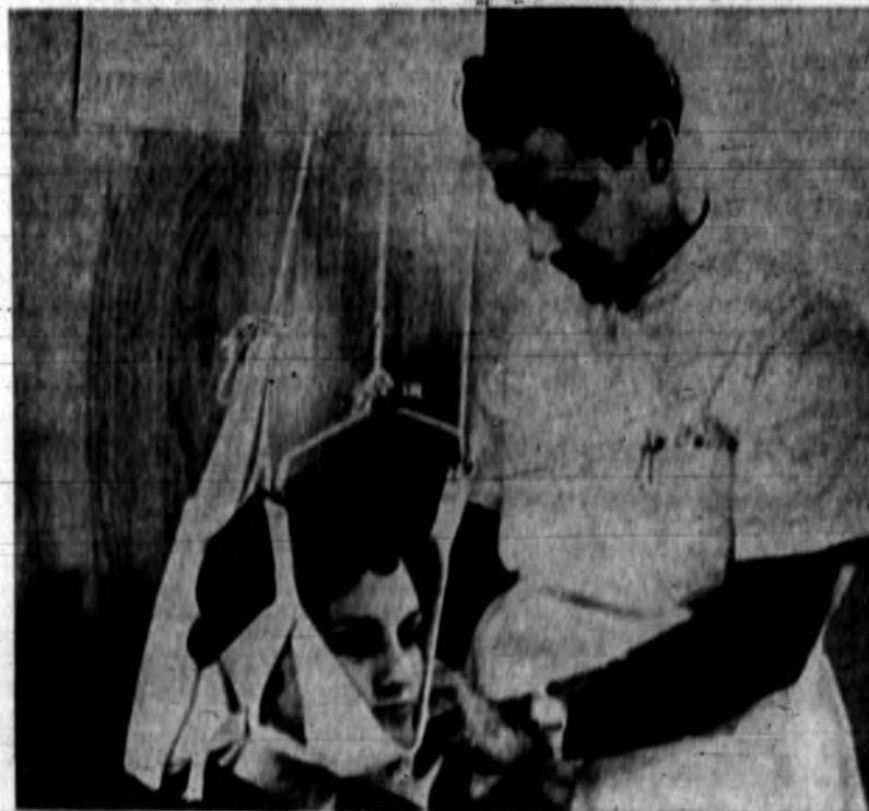
TRACTION . . . This apparatus is used for sore necks such as those resulting from auto accidents.