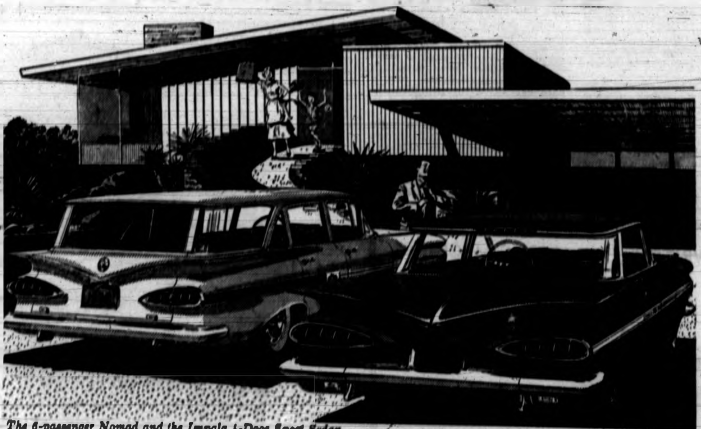
The 6-passenger Nomad and the Impala 4-Door Sport Sedan.

now—see the wider selection of models at your local authorized Chevrolet dealer's!