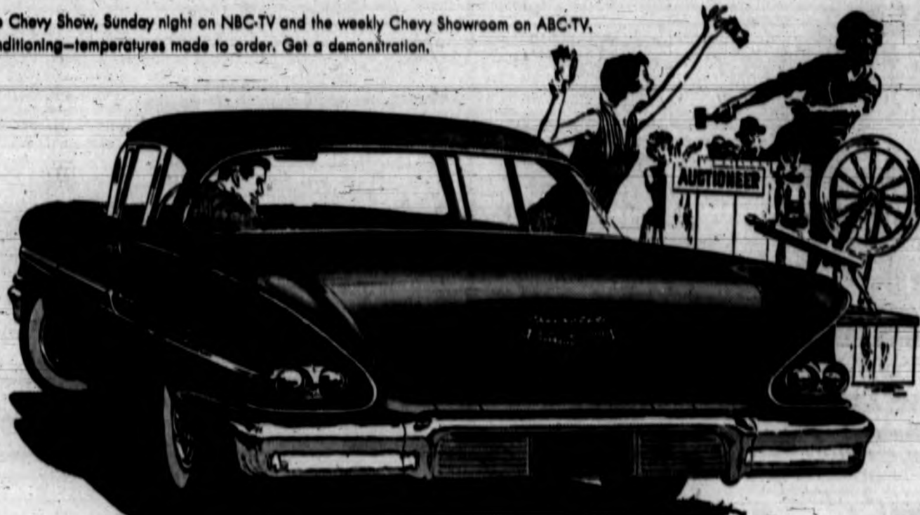
The Bluewyn 2-Door Sedan—nothing so new or nice near the price.

See the Chevy Show, Sunday night on NBC-TV and the weekly Chevy Showroom on ABC-TV. Air conditioning—temperatures made to order. Get a demonstration.