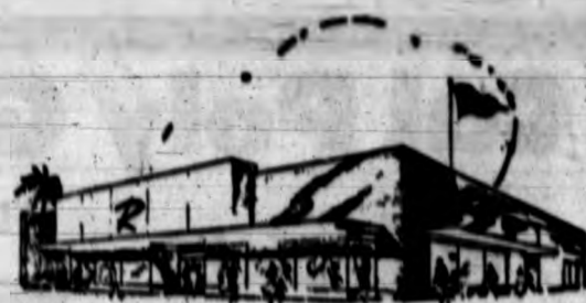
Rileys - Chorro at Marsh

WELCOME TO CAL POLY and to San Luis Obispo! See Rileys First for all of your clothing needs